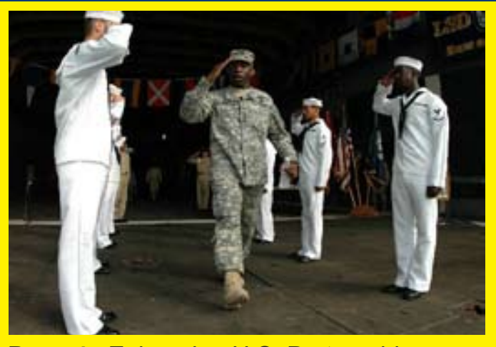
Page 4...Enhancing U.S. Partnerships

Director, Defense Security Cooperation Agency