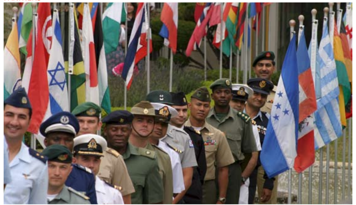
The Naval Postgraduate program is one of many International Military Education and Training opportunities available to U.S. partner nations