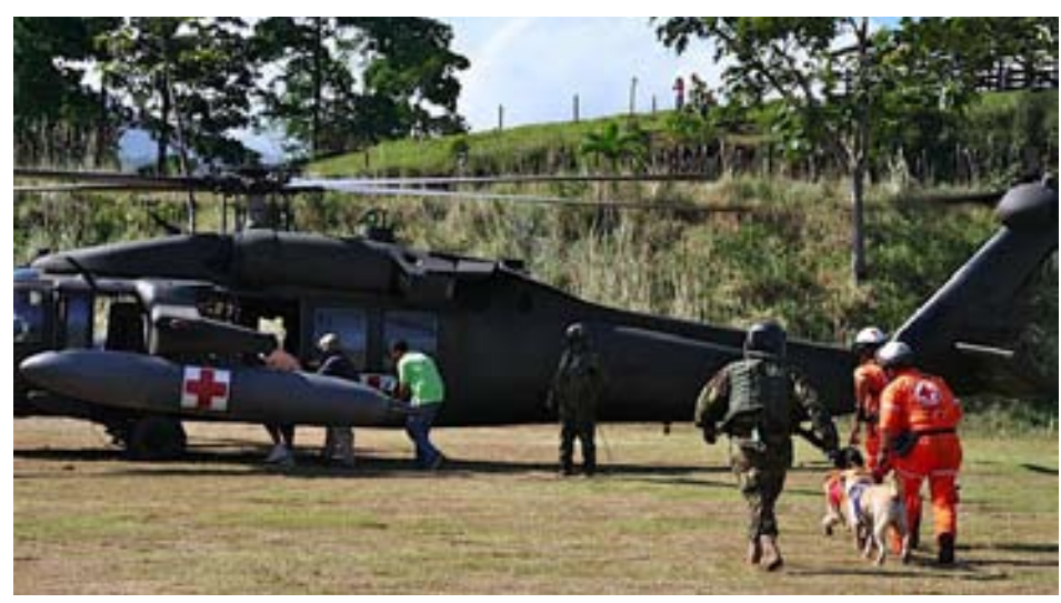
Costa Rican rescue workers and dogs board a U.S. Army Blackhawk helicopter that is transporting them to the sites affected by the Jan. 8 earthquake that rocked the Central American nation.

COCOM approaches to humanitarian assistance differ, based on the needs within their respective areas of responsibility.