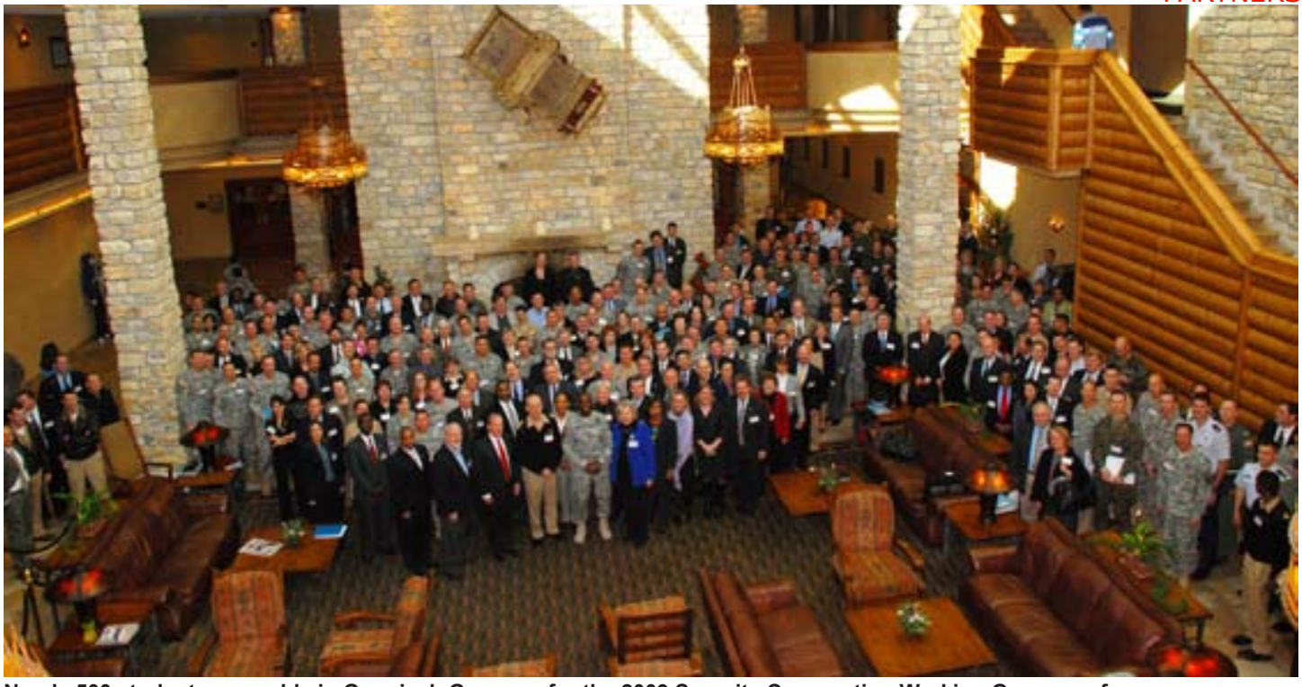
Nearly 500 students assemble in Garmisch Germany for the 2009 Security Cooperation Working Group conference.