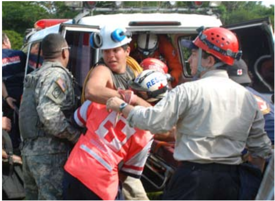
Members of the Costa Rican Red Cross load an earthquake victim with a broken leg into an ambulance.

"When a disaster occurs, DSCA, the Office of U.S. Foreign Disaster Assistance (a part of the United States Agency for International Development, (USAID)), OSD Policy, and the Joint Staff begin talking immediately discerning the status of the event, what the country requires and what the U.S. govern-