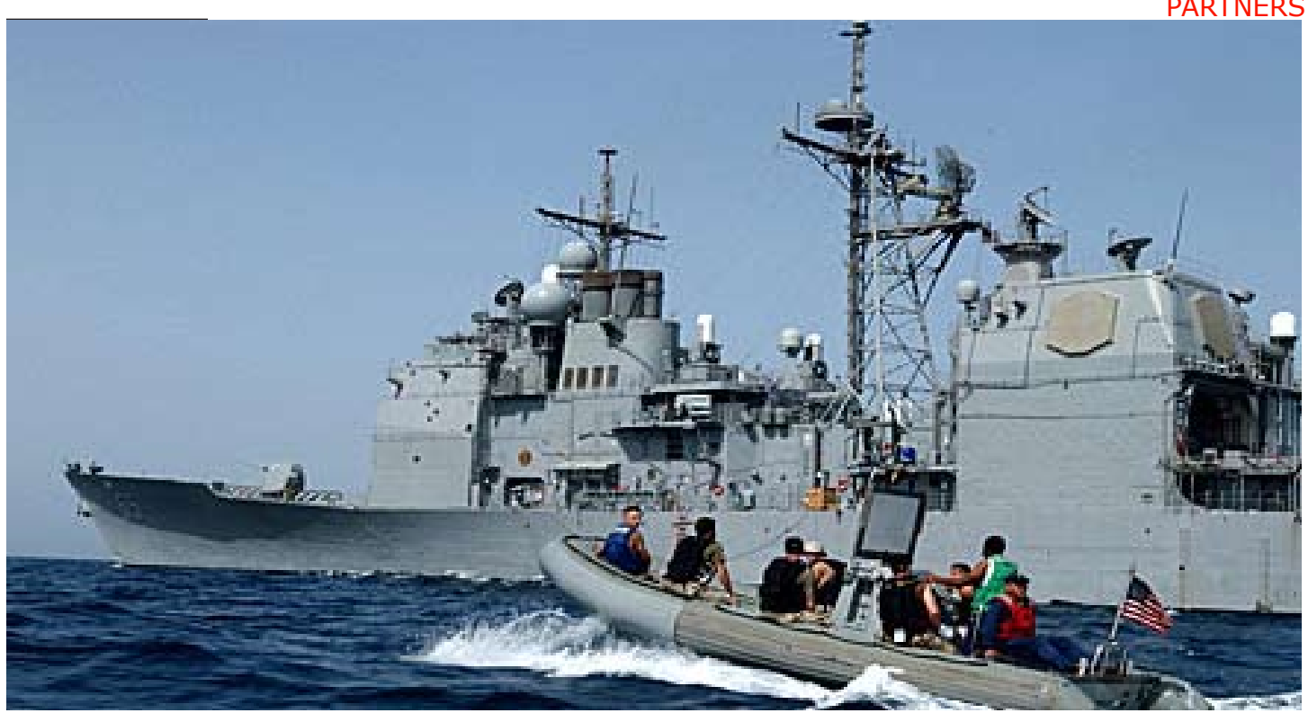
USS Leyte Gulf crew members return to ship following a brief visit ashore.