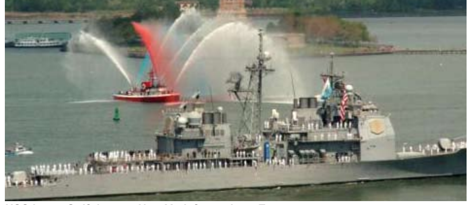
USS Leyte Gulf departs New York for a trip to Europe.

The U.S. Congress passed the largest APRIL 2009