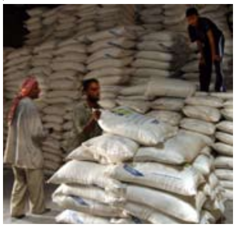
DSCA works closely with State, the Combatant Commanders and the host nations to get food and supplies to those in need around the world.

She says, "SOUTHCOM is growing by leaps and bounds. This is SOUTHCOM's primary engagement tool, and its leadership is a tremendous proponent. Disaster preparedness projects are very popular, given that so many areas within SOUTHCOM are prone to hurricanes, earthquakes, and volcanic activity. Mine action is also becoming a little more attractive."