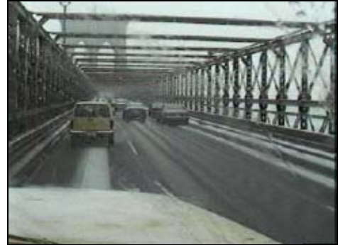
City of New York, NY Bridge Section Treated with Anti-Icing System

Keywords: snow, ice, winter storm, anti-icing/deicing system, freeway management, winter maintenance, bridge, forecasts, treatment strategy, chemicals, maintenance vehicle, air temperature, pavement temperature, pavement condition, traveler information, advisory strategy, dynamic message sign (DMS), closed circuit television (CCTV), safety, mobility, productivity