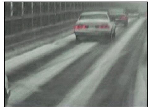
City of New York, NY Bridge Section Treated with Truck-Mounted Sprayer