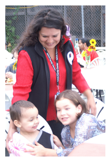
Three attendees take part in the Native American Youth and Family Center's Celebration of Healthy Relationships in Portland, Oregon.

The end of 2008 concluded another successful year for ANA's mission and work in Native American communities in the continental U.S., Alaska, and the Pacific Islands. During the year, teams of Impact Evaluators journeyed to 87 of the 125 projects that ended in 2008. Each visit was a chance for ANA to reunite with the grantee to learn about