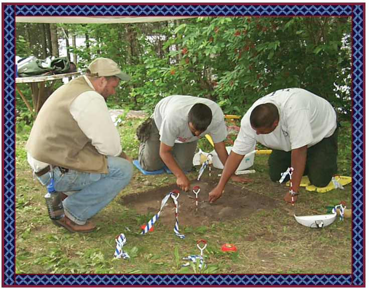
1854 Treaty Authority protecting natural and cultural resources - Minnesota