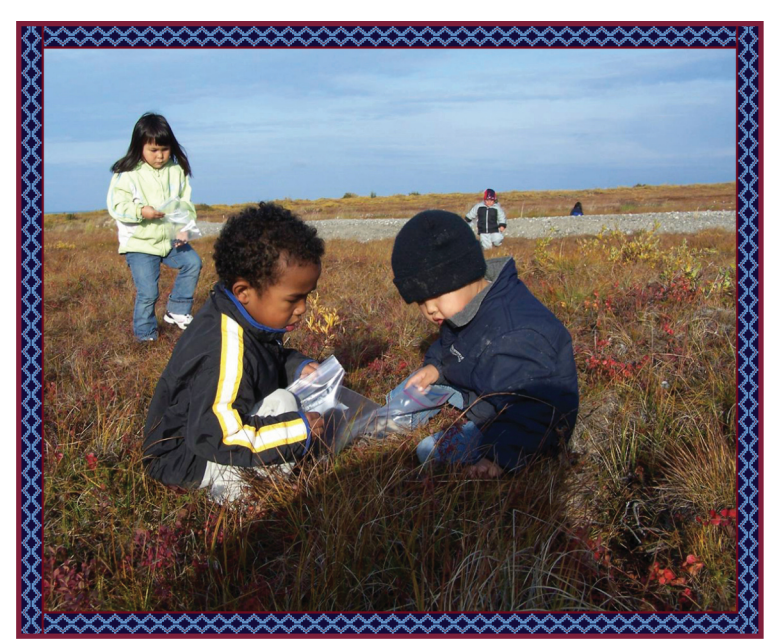
Kotzebue Native Village's Capacity Building for Nikaitchuat Llisagviat Immersion School - Alaska