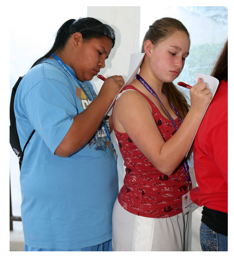
Native youth collaborate and consider positive life choices.

A: As NIWHRC became involved in Indian women's health we were able to see the significant need to address many of the same issues for young girls. By looking at the statistics and studies of adolescents, it was imperative that action be taken to bolster the self-esteem and resiliency of Indian youth. Adolescents are at the age where they can be