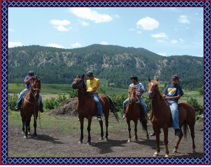
Lodge Pole District Horsemanship Project (Nakoda Horse Society) - Fort Belknap Indian Reservation, Montana