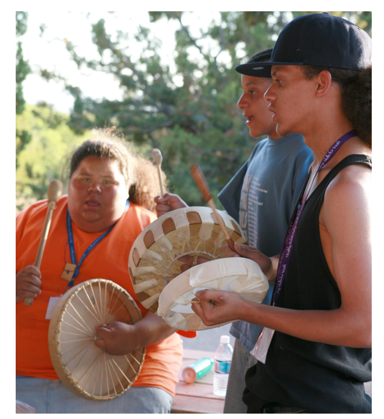
Circle of Positive Choices cultural activities connect youth to native traditions and build group cohesion.

A: The curriculum was developed by surveying youth mentors from tribal youth programs participating in a previous project. We also included native elders in our discussions. Following this, we used focus groups and guided brainstorming to establish the core elements of both projects. Once we finished creating the curriculum, we held pilot tests with youth to get feedback. They gave us very good insight into necessary changes. From this, we put together "Toolkits," ready-to-use guides for facilitators, which include discussions of real-life issues, culturally relevant student handouts, "out-of-seat activities," and teaching tips. Our partners are very satisfied with the toolkits, and continue to use them in their communities. We have trained several hundred youth – who have found the training to be dynamic and highly engaging. These toolkits are available for $25.00 each. They can be ordered by calling our toll free number 1-866-4NIWHRC . We also will provide "train the trainers" workshops for a fee.