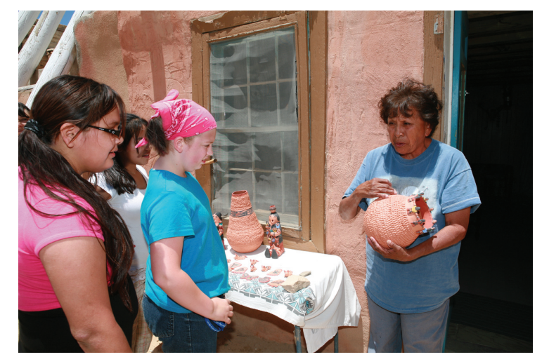
Native teens from Oklahoma visit Acoma Pueblo (NM) to learn about other native cultures.