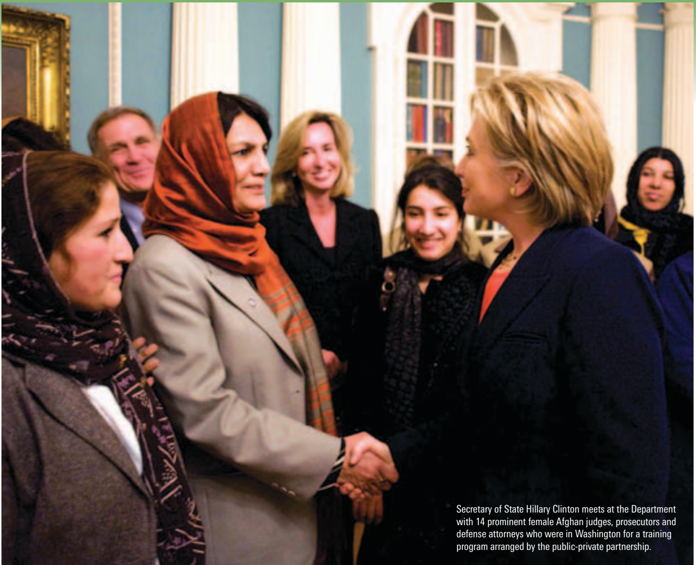
Secretary of State Hillary Clinton meets at the Department with 14 prominent female Afghan judges, prosecutors and defense attorneys who were in Washington for a training program arranged by the public-private partnership.

workshops in the United States. The first was a 21-day intensive summer program at the University of Utah Law School for 16 Afghan prosecutors, including three women. The second was a 14-day program in Riverside, Calif., and Washington, D.C., for 14 prominent Afghan women judges, prosecutors and defense attorneys. Among the workshop's speakers was former U.S. Supreme Court Justice Sandra Day O'Connor.