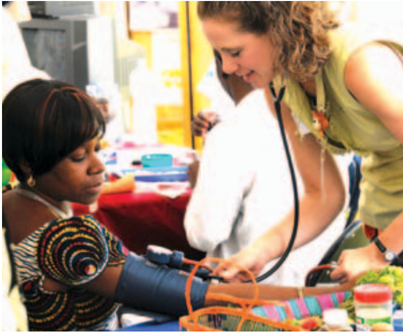
A woman has her blood pressure taken at Embassy Bamako's health fair.