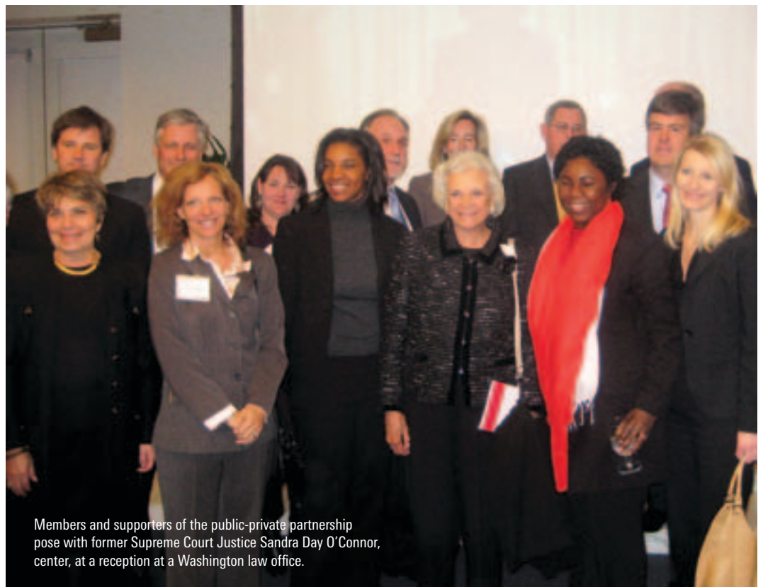
Members and supporters of the public-private partnership pose with former Supreme Court Justice Sandra Day O'Connor, center, at a reception at a Washington law office.

The partnership has planned and implemented two major