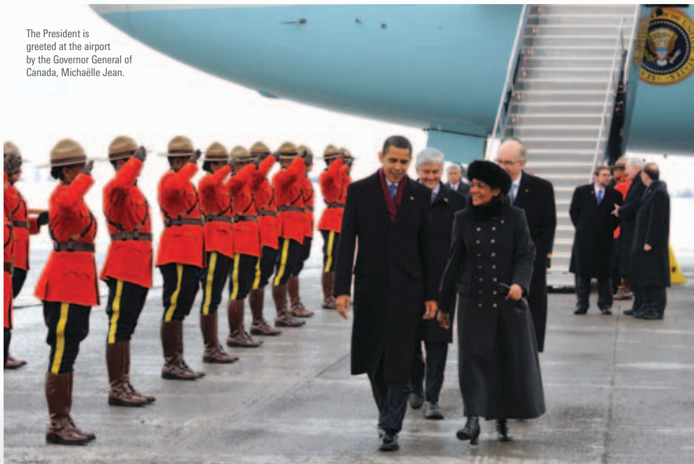
The President is greeted at the airport by the Governor General of Canada, Michaëlle Jean.

The staff especially appreciated the collegial approach of the 10-member White House advance team. All were campaign veterans familiar with the President's preferences, but they were the first to admit they were new at working with the large number of players involved in an official overseas visit.