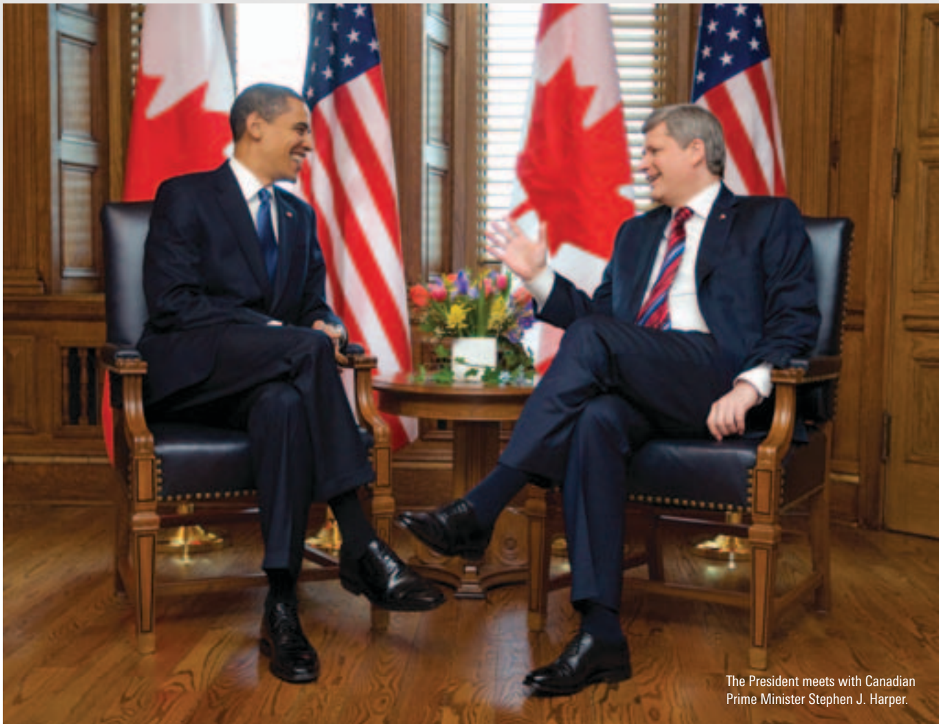
The President meets with Canadian Prime Minister Stephen J. Harper.