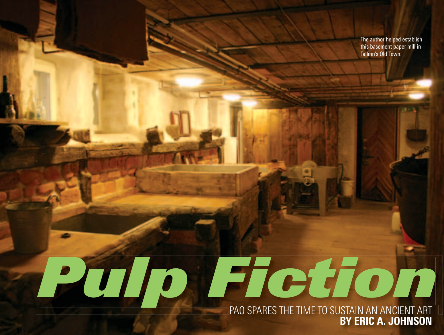
The author helped establish this basement paper mill in Tallinn's Old Town.