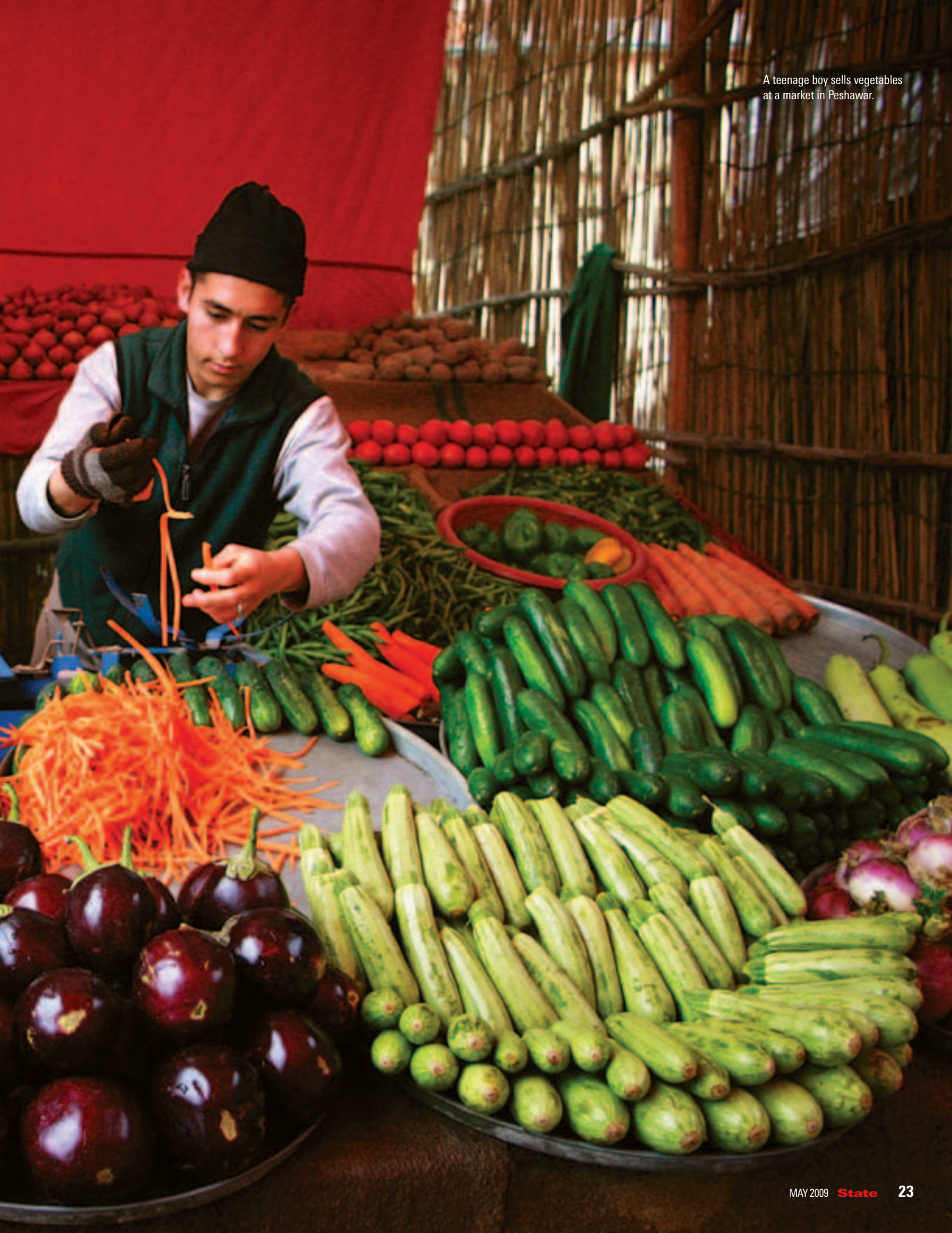
A teenage boy sells vegetables at a market in Peshawar.