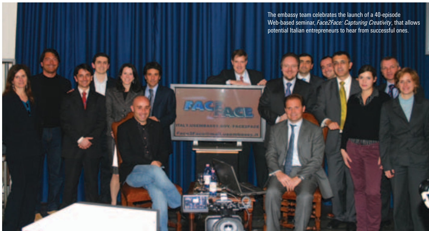
The embassy team celebrates the launch of a 40-episode Web-based seminar, Face2Face: Capturing Creativity , that allows potential Italian entrepreneurs to hear from successful ones.