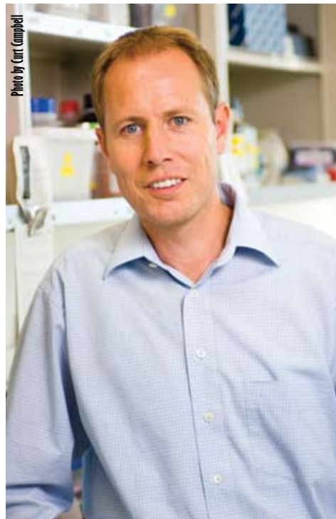
Tony Wyss-Coray, PhD.

When Wyss-Coray's team tested the biomarkers with an additional 92 blood samples, the protein analysis matched the clinical diagnosis about 90 percent of the time. Even more intriguing was the next phase of the experiment: Used on blood samples from 47 people with mild cognitive impairment—an Alzheimer's precursor—the test predicted with about 80-percent accuracy which patients would