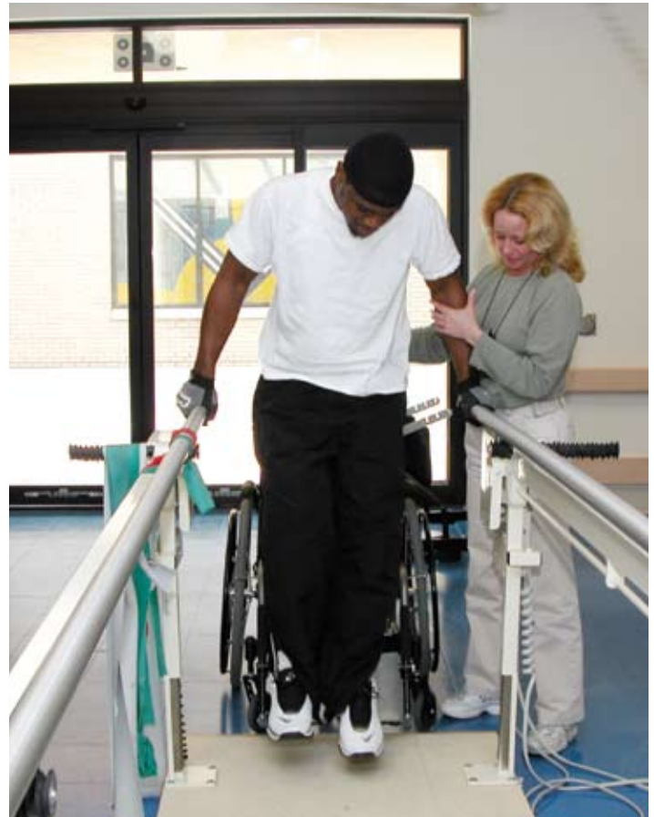
Patients in VA polytrauma care, such as this veteran at the Tampa VA Medical Center, may benefit from a research project aimed at training peer visitors.