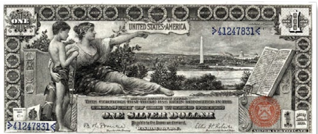
$1 silver certificate, series 1896

Sometimes the symbolism employed on a bank note can provoke a strong reaction from the public. That was the case with at least one of the notes in the U.S. Educational series of 1896. The $1 silver certificate in this series is widely considered one of the most beautiful designs ever used on American paper money. On it, a woman representing history instructs a boy about the U.S. Constitution, which has been engraved on a plaque. The background shows the landscape of Washington, D.C.