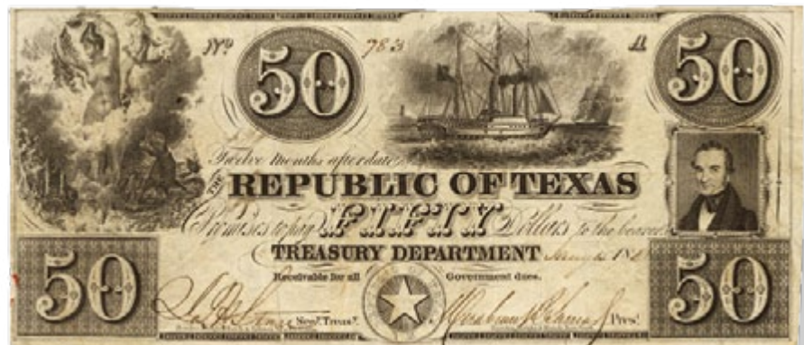
$50 note issued by Republic of Texas, pre-1845

There was more than one independent nation in America issuing bank notes in the period between the Revolutionary War and the Civil War. The Republic of Texas declared its independence from Mexico in 1836 and remained an independent nation until 1845, issuing its own paper money.