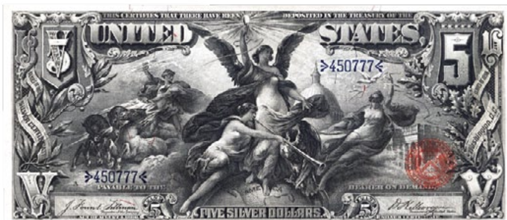
$5 silver certificate, series 1896

However, the $5 note in this beautiful series became the subject of a great deal of controversy. In the center of this magnificent