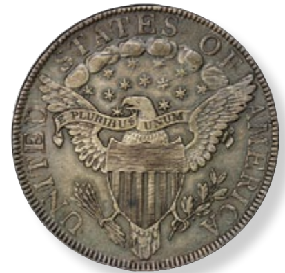
Silver coin, circa 1801–1807

instead of the left. Some European journalists and diplomats interpreted this as an expression of American belligerence and tried to use it as grounds for promoting war with the United States. In response, a new design was created in 1807 for the backs of American silver coins. This time, the olive branch — representing peace — was placed in the dominant right talon, putting an end to the journalistic saber rattling. The eagle holds a banner in its beak with the words “E Pluribus Unum,” which Thomson translates to mean “Out of many, one.”