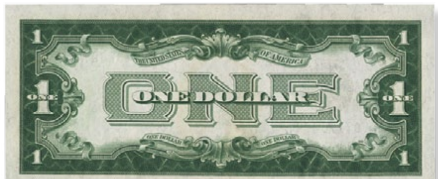
$1 silver certificate, series 1928

As you can see from the image at right, the first small sized dollar bills issued in America did not feature the Great Seal or much of any symbolism at all. Today, paper money collectors refer to currency with this design as “funny backs.”