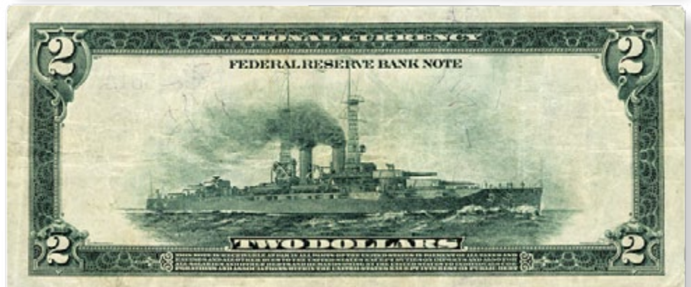
$1 and $2 Federal Reserve bank notes, series 1918