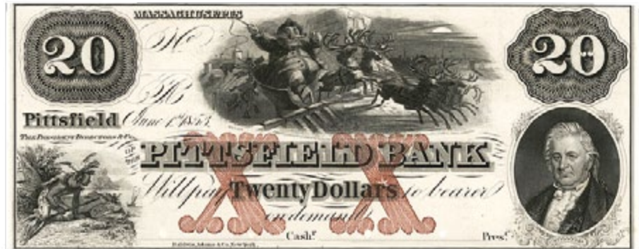
$20 private bank note, 1850s

Other notes feature unique design elements as well. The Santa Claus note shown here is whimsical and entertaining and very much in demand by collectors. The Santa Claus design suggests happiness and generosity — characteristics not often associated with banks.