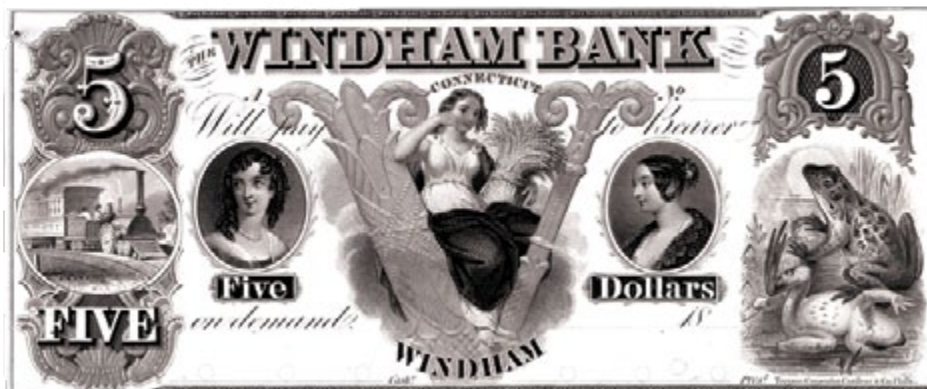
$5 private bank note, 1850s

In 1754, at the time of the French and Indian War, the legend says that two Windham men were returning home through the woods late one night when they were startled by strange and terrifying noises echoing through the night air.