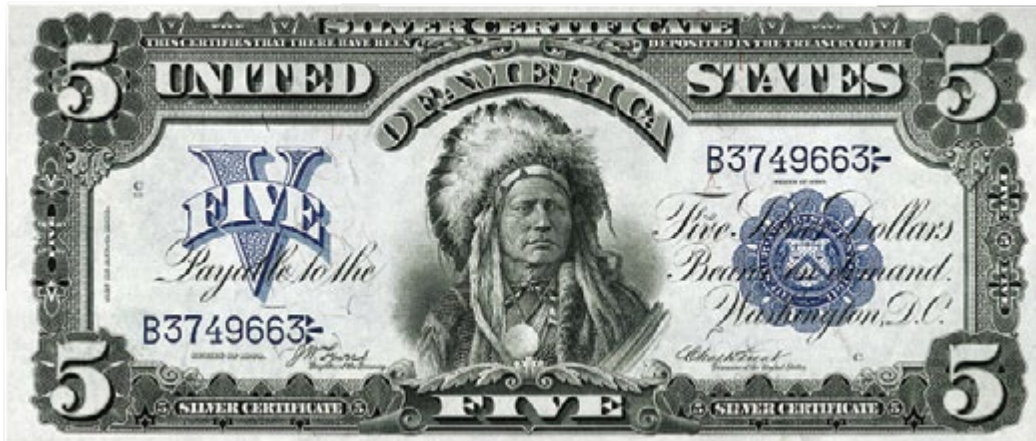
$5 silver certificate, 1899

note is an allegorical female representing electricity as the most dominant force in the world. While classical female figures appeared on hundreds of different bank notes throughout the 19th century, this particular note elicited a violent negative reaction at the time from senators' wives.