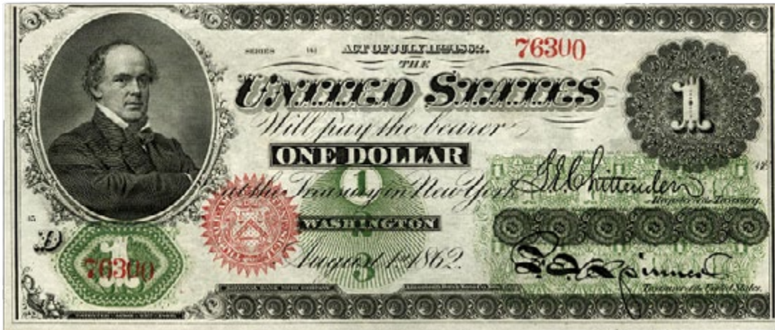
$1 legal tender note, issued in 1862

On the front of today's $1 note, you see the modern U.S. Treasury seal (shown at right). The balancing scales represent justice. In the center of the seal, the chevron's 13 stars represent the 13 original colonies. The key underneath is an emblem of official authority. According to the Treasury Department, the original seal, which was very similar to the one shown here, was designed by Francis Hopkinson, a delegate to the Continental Congress. The present, more streamlined design was approved in January 1968.