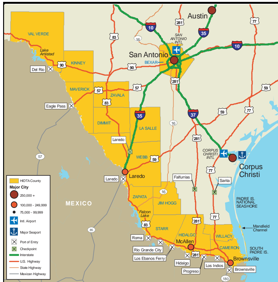
Figure 2. South Texas HIDTA region transportation infrastructure.

South Texas. Traffickers easily traverse the Rio Grande River, which demarcates the border and which, in many locations, can be crossed on foot, in boats, or by vehicle. After shipments are smuggled across the river, they are generally loaded into waiting vehicles for transport to a stash location or concealed in vegetation until they can be retrieved. However, traffickers try to avoid stashing drug shipments along the river; doing so leaves the drugs vulnerable to theft by other DTOs or seizure by law enforcement officers.