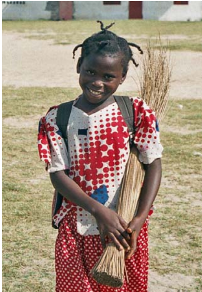
C. FEEZEL, USAID