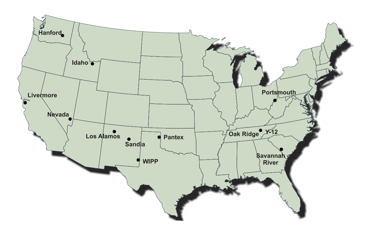
Figure 1. Location of Major Department Defense Nuclear Facilities

Figure 1 provides the locations of the major Department facilities involved in defense nuclear activities across the United States.