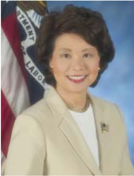
Elaine L. Chao Secretary of Labor

As I look back over the events and challenges faced by our Nation and the Department of Labor during 2003, I am proud of our accomplishments and excited about the foundation we are preparing for the future American worker. Not only does this year's annual report theme — A Competitive Workforce for a Global Economy — describe our current efforts to advance the Nation's prosperity in a dynamic world order, but it also serves to focus where we must put our energies in the years ahead. With the publication of the Department's FY 2003 – 2008 Strategic Plan , we have formally articulated the importance of A Competitive Workforce as a fourth strategic goal. This goal complements our other goals — A Prepared Workforce, A Secure Workforce, and Quality Workplaces — by seeking to identify the emerging changes in our economy, the implications for our Department, and the initiatives we must develop to meet the demands for a skilled and productive workforce in the 21st Century.