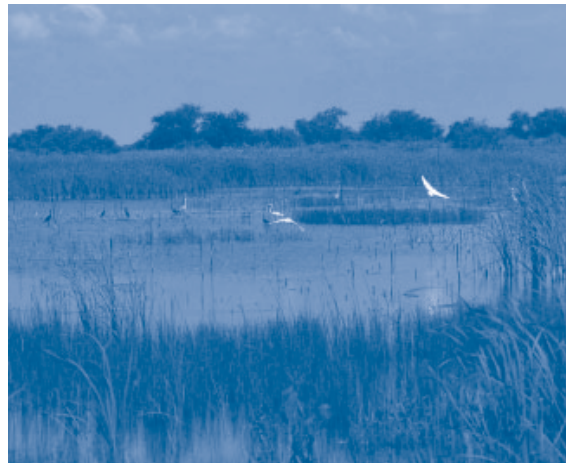
Restored wetland preserve

Projects have one year to accept funding offers.