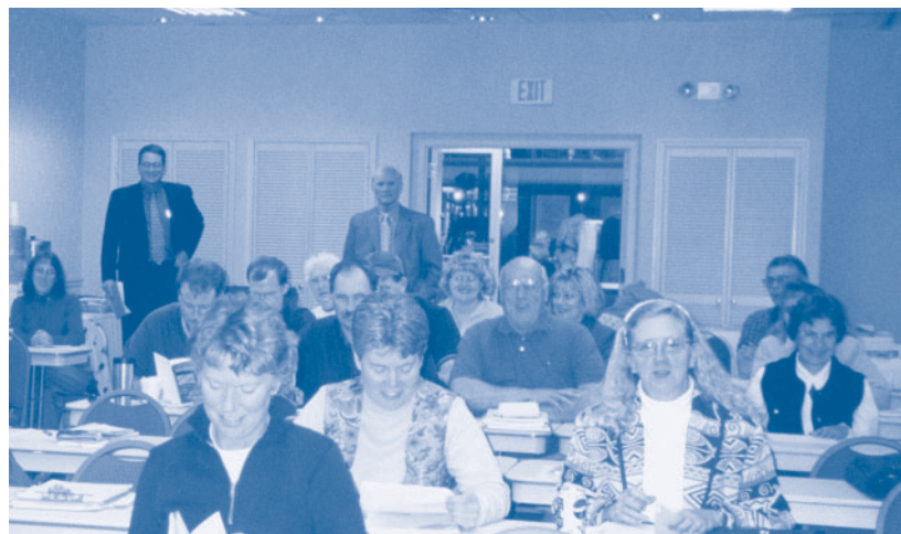
Montana W 2 ASACT workshop participants

W 2 ASACT meets on a bimonthly basis to coordinate program efforts, and subcommittees pursue program improvements between meetings. A series of workshops around the state in the spring and the fall allow W 2 ASACT programs to provide face-to-face advice and assistance to communities as they develop and finance water, wastewater, and solid waste infrastructure projects. These workshops