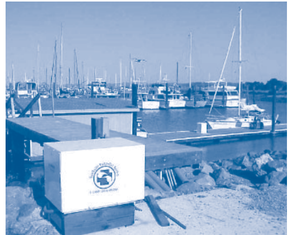
Marina pump-out station