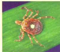
Lone Star Tick