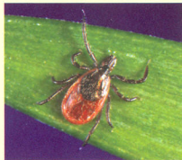
Black-Legged Tick ("Deer Tick")