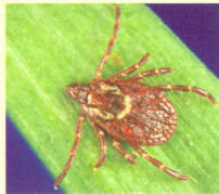
American Brown Dog Tick

NH Department of Health and Human Services