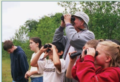
Bird-watchers at the Hoquarton Interpretive Trail, built on a former brownfield in Tillamook, Oregon.

A brownfield is a property, the expansion, redevelopment, or reuse of which may be complicated by the presence or potential presence of a hazardous substance, pollutant, or contaminant. It is estimated that there are more than 450,000 brownfields in the U.S.