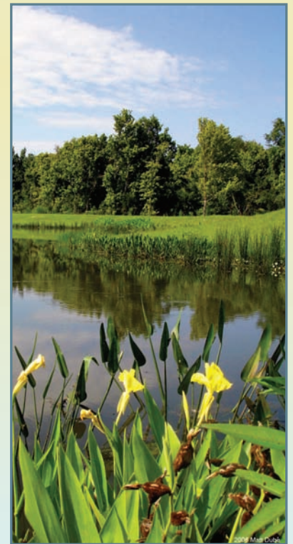
Depot Park in Gainesville, Florida, built on a former brownfield.

Employing an integrated approach of compliance assistance, compliance incentives, and innovative civil and criminal enforcement, OECA and its partners seek to maximize compliance and reduce threats to public health and the environment. http://www.epa.gov/compliance/about/index.html