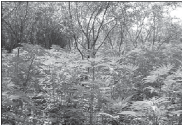
One of 14 marijuana fields located in the Crabtree Nature Preserve.