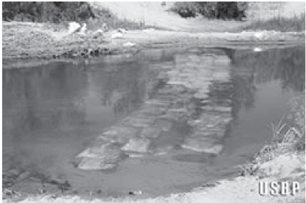
Traffickers constructed this sandbag bridge to transport drugs via vehicles across the U.S.-Mexican border.

On January 19, 2007, Osiel Cardenas-Guillen, head of Mexico's Gulf Cartel that controlled large-scale marijuana and cocaine trafficking from Mexico to the United States, was extradited to the United States, along with 14 other of the world's most violent and ruthless criminals. Cardenas-Guillen was captured on March 14, 2003, by law enforcement in Mexico, with the assistance of DEA, the FBI, and U.S. Customs. Cardenas-Guillen was one of the most wanted, feared, and violent drug traffickers in the world. The Gulf Cartel was responsible for the transportation of thousands of kilograms of drugs into the United States from Colombia through Mexico's Northeastern region. Administrator Tandy said of the historic extraditions: "It was a clean sweep—those extradited include leaders from all four of Mexico's major drug cartels: a gatekeeper who controlled drug smuggling across the border for the Juarez cartel; two top echelon lieutenants of the Tijuana cartel; the kingpin of the Gulf Cartel, Osiel Cardenas-Guillen; and two high-level lieutenants, two mid-level lieutenants, and both a high and mid-level transportation coordinator for the Federation. These extraditions are unprecedented in the history of Mexico."