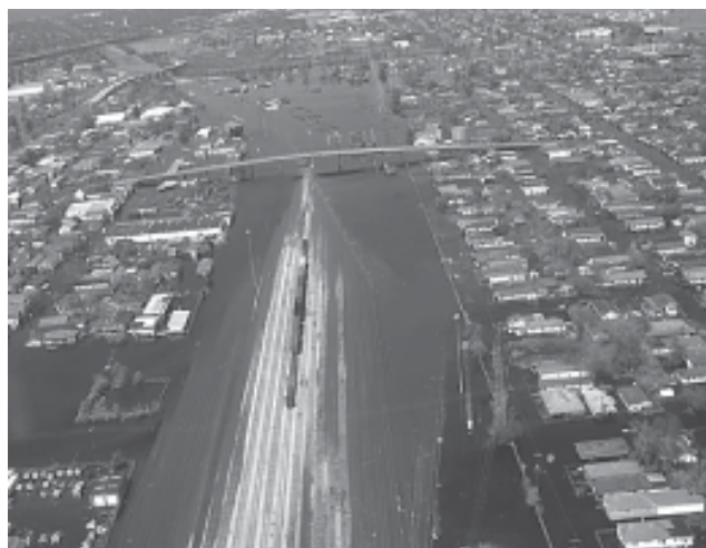
New Orleans after Hurricane Katrina.

The DEA team who rescued 70 elderly and infirm patients from a New Orleans nursing home trapped in the aftermath of Hurricane Katrina won the Attorney General's Award was a finalist for the 2006 Service to America Citizen Services Medal for their impact on addressing the needs of the nation. The team, despite nearby gunfire, rising waters, and looters, carried the residents, many crippled in wheelchairs and bedridden, down five flights of stairs to safety and provided supplies to dozens more who were evacuated days later. For DEA's heroic actions in rescuing over 3,000 stranded Americans during Hurricane Katrina, Hearst Newspapers lauded DEA as one of only two agencies in the relief efforts to get the "people piece right" in its emergency response.