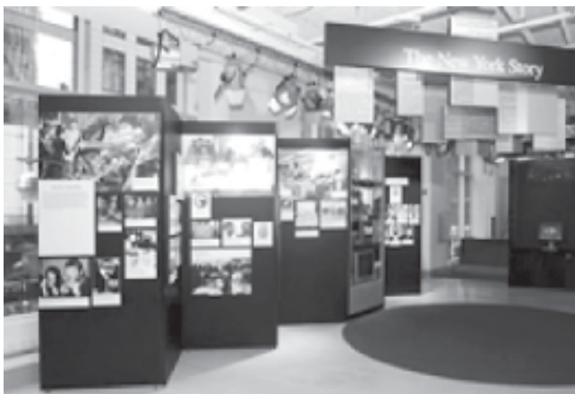
The "New York Story" portion of the exhibit focused on the drug trends in New York over time and on specific incidents that occurred in the NYFD.