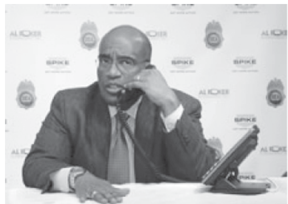
Al Roker speaks with a member of the media during a conference call to announce the new series.

"DEA" received positive media attention. The New York Times review of "DEA" put it in perspective: "With so much attention focused in recent years on the war on terror and the dangerous work being done by American soldiers, the main contribution of 'DEA' may be to remind us that there is still a war on drugs being waged as well, with similar dangers and urgency."