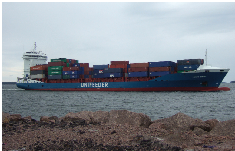
A Seaway-sized Unifeeder ship transporting containers to the port of Kotka.

The surface area of the Baltic is 35 percent larger than the Great Lakes, but their water volumes are almost identical. The water of the Great Lakes is fresh, while that of the Baltic is brackish, but just like the Great Lakes, the Baltic is home to large cities (6 have metropolitan-areas with over 1 million people), as well as to environmentally sensitive natural areas. The challenges of balancing economic needs with environmental concerns in the Gulf of Finland would be familiar to any Quebecker or Minnesotan. The Baltic Sea is also home to a "sister" lock system to the Seaway: the Saimaa Canal—a binational waterway consisting of eight locks between Russia and Finland that links the Finnish interior to world markets 10 months of the year.