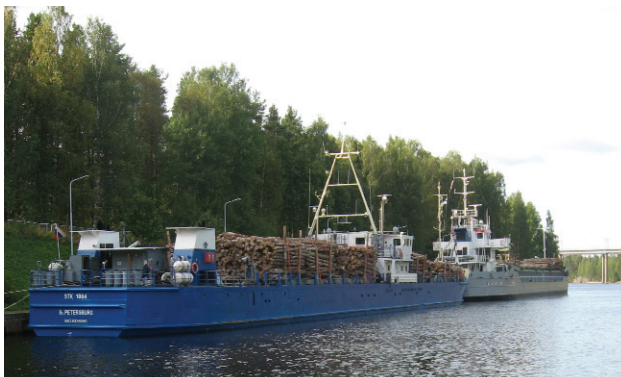
Ships along the Saimaa Canal.

(400–1000 containers) throughout the Baltic. The prospects for growth in this trade are such that the Port and City of Helsinki are building a brand new container port (to open in November) in Vuosaari, 30 miles east of the current downtown port. The Vuosaari port project is a good example of how government, private industry, and environmental interests can unite to promote economic growth in the maritime sector, while doing so in a sustainable (i.e., environmentally sensitive) manner.