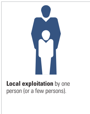
Exhibit 3. Organization of commercial sexual exploitation of children

Exhibit 3, “Organization of commercial sexual exploitation of children,” illustrates the organizational structures of CSEC.