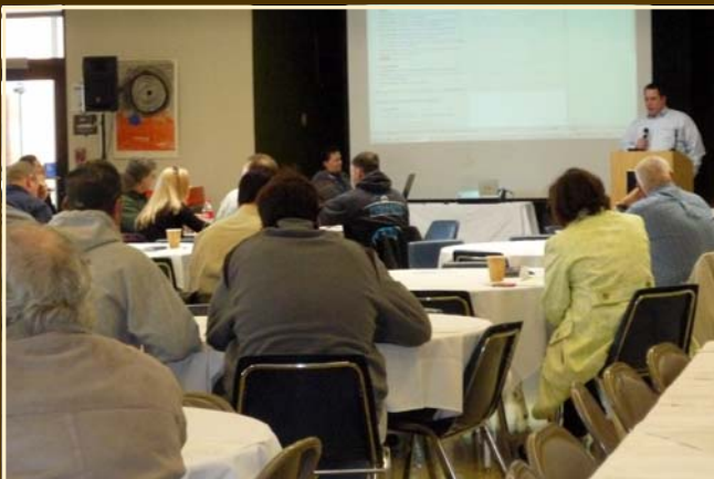
Fifty business people attended at Blue Mountain Community College in Pendleton.