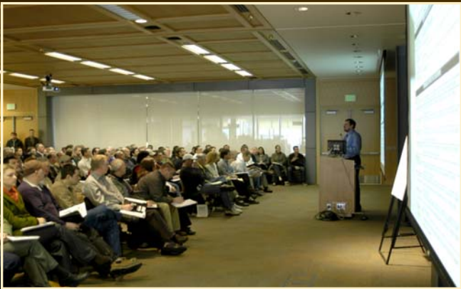
Portland area drew the largest crowd (600 total) who filled Portland Community College's Rock Creek Campus's facility