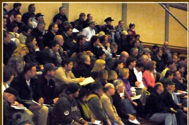
150 people lined the bleachers at Central Oregon Community College in Bend to hear about state projects .