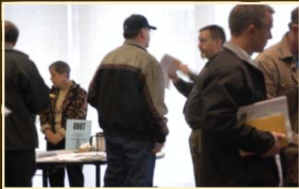
Time for networking.