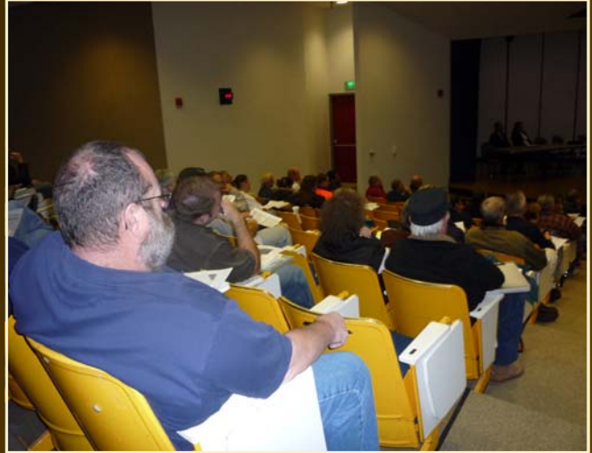
Cold weather did not deter 110 people who filled the auditorium at Oregon Institute of Technology in Klamath Falls.