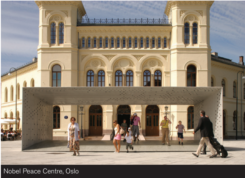
Nobel Peace Centre, Oslo

The Nobel Peace Center presents the history of the Peace Prize and explains the work of its laureates. The Center unites an existing building with new structures and enabled visitors to interact with new technologies, enhancing their experience.