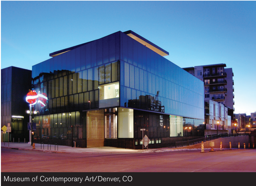
Museum of Contemporary Art/Denver, CO

The new facility is on track to gain LEED Gold certification and will be the USA's first LEED certified contemporary art museum. With exhibition, education and lecture spaces, library, bookshop, café and a rooftop garden for outdoor art, the Museum presents new work from around the world.