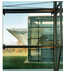
Census Bureau, Bowie, MD Davis Brody Bond and SmithGroup

SmithGroup is an 800-person, international A/E firm with offices in Washington, DC. The firm's Cultural Studio is dedicated to museum and civic work and has provided similar services for facilities of equivalent scope to NMAAHC including The National Museum of the American Indian as well as many other projects for the Smithsonian Institution. SmithGroup has considerable experience collaborating with multiple firms on significant projects including the National Museum of the American Indian, the Normandy American Cemetery Visitor Center, Science City at Union Station, and the International Spy Museum.