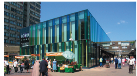
Idea Store Chrisp Street, UK - Adjaye Associates