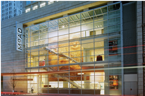
Museum of the African Diaspora (MoAD) San Francisco, CA