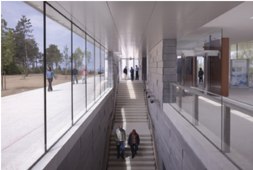
Normandy American Cemetery Interpretive Center Normandy, France