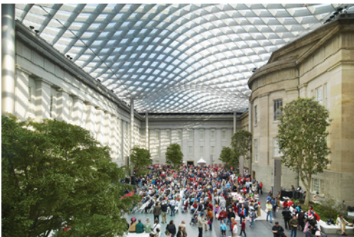
Robert and Arlene Kogod Courtyard, Donald W. Reynolds Center for American Art and Portraiture, Washington, DC