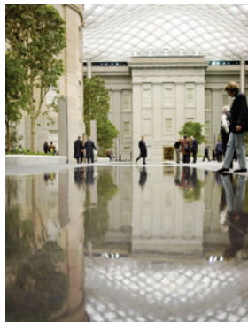
Landscape Design: Kathryn Gustafson

The landscape design balances a formal relationship between courtyard, building and roof, with a dynamic east-west composition of long, thin rectangular planters and a scrim of water which is allowed to traverse the entire length of the courtyard, underlining the dynamic sense of motion in the composition.