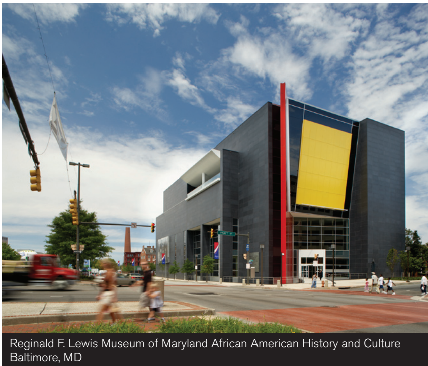
Reginald F. Lewis Museum of Maryland African American History and Culture Baltimore, MD

A major addition to Baltimore's Inner Harbor and museum district, the museum incorporates extensive exhibit areas, interactive learning centers, offices, a 200-seat auditorium, library/ resources center, gift shop and café.