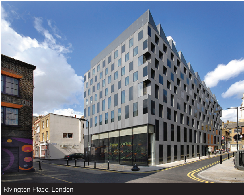
Rivington Place, London

A key addition to the London art scene and 2008 RIBA London Award winner, Rivington Place is dedicated to work by practitioners from culturally diverse backgrounds. It is a center for the presentation and dissemination of those ideas and practices in the contemporary visual arts which have to date been marginalized by the more mainstream cultural institutions.