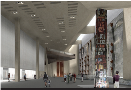
National September 11 Memorial and Museum at the World Trade Center, New York, NY