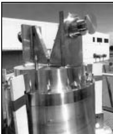
Spent fuel shipment cask for moving spent fuel from K Basins to new canister storage building, Hanford Site, Richland, Washington

The audit found that, although the Department had planned to move approximately 66 overpacks from the K Basins to dry storage by March 20, 2002, only 50 overpacks had been moved by that date. More significantly, persistent equipment problems and process complexities kept the Department from