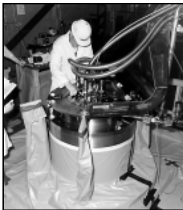
Nuclear chemical operator attaching hoses to ports in the top of a multi-canister overpack holding 290-300 irradiated fuel assemblies from Hanford's K Basins, in the cold vacuum drying facility, Hanford Site