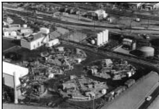
In-Tank Precipitation Facility, Savannah River Site

The Department's Savannah River Site stores approximately 38 million gallons of high-level waste, including 35 million gallons of salt waste and 3 million gallons of sludge. To treat salt waste, the Department originally planned to process the waste through the Savannah River Site's In-Tank Precipitation Facility. In February 1998, however, the Department suspended operation of the Facility because it could not be operated safely. As a result, the Department searched for an alternative treatment technology for waste, and, in June 2001, issued its Salt Processing Alternatives Final Supplemental Environmental Impact Statement. The impact statement narrowed the alternatives to four treatment technologies: small tank precipitation; ion exchange; solvent extraction; and direct disposal in grout. In October 2001, the Department announced the selection of solvent extraction as the preferred treatment technology.