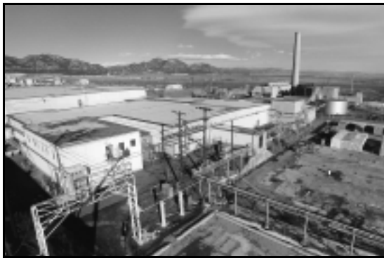
Rocky Flats - View looking northwest of Building 776/777, Rocky Flats Environmental Technology Site, Golden, Colorado

packaged into 1,900 containers prior to being shipped to the Savannah River Site. In 1998, the Department established a target for stabilizing and packaging the plutonium at Rocky Flats by May 31, 2002. To do so, the Department procured and installed the Plutonium Stabilization and Packaging System (Stabilization System) at Rocky Flats, a machine operated by the Rocky Flats contractor Kaiser-Hill Co., LLC (Kaiser-Hill).