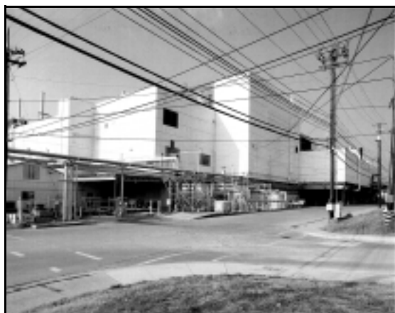
Building 9201-5 Alpha 5 at Y-12 Plant Oak Ridge, Tennessee

Currently, the Y-12 National Security Complex in Oak Ridge, Tennessee, (Y-12) is the only site capable of manufacturing and remanufacturing certain unique components necessary for assembling nuclear weapons. Many of these components are produced at Y-12’s Depleted Uranium and Binary Metal Cycle Operations facility. Because the Depleted Uranium facility is the sole producer of these key components, an audit was conducted to determine if NNSA can ensure its reliability. Y-12 is currently managed and operated by Department contractor, BWXT Y-12, LLC.