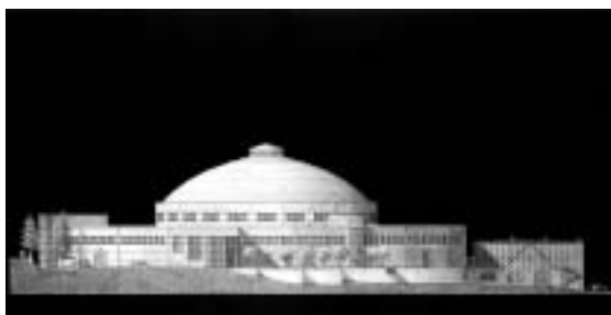
Artist's rendering of the Advanced Light Source at Lawrence Berkeley National Laboratory

faced in areas such as health care, defense, energy production and use, anti-terrorism, and the environment. During this reporting period, the OIG completed reviews that examined whether the Department was managing Research and Development activities efficiently.