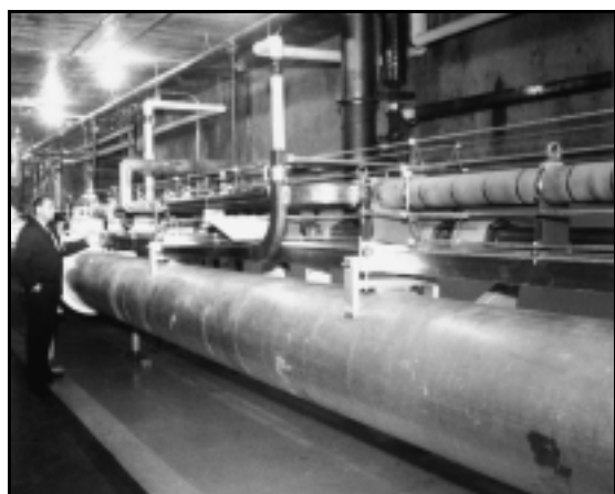
The beam line tunnel at Stanford Linear Accelerator Center, Palo Alto, California

An OIG audit focused on two of the four facilities, the Advanced Light Source located at Lawrence Berkeley National Laboratory (Berkeley) and the Stanford Synchrotron Radiation Laboratory located at the Stanford Linear Accelerator Center (Stanford). Both of these facilities generate and deliver soft x-ray and vacuum ultra-violet light in the form of beams and are operated by facilities management contractors. Scientists at Berkeley and Stanford are allocated beam line time to perform a variety of research. The audit was conducted to determine whether beam lines at these facilities were being used to the fullest extent.