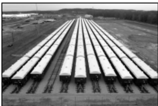
Waste pits project rail yard with 170 railcars, Fernald Environmental Management Project

Congress established the Defense Facilities Closure Projects account (Closure Account) in 1997 to help focus management attention on cleanup activities at selected Department sites. Congress expected the Department to find ways to accelerate cleanup activities at the sites and ensure that site closure was achieved by the end of FY 2006. Also, Congress required the Department to seek the resources necessary to keep these projects on schedule for closure in 2006 or earlier. The Closure Account provided funding to the Department for the accelerated cleanup of the Fernald Environmental Management Project (Fernald). Through December 2001, the Department spent about $2.8 billion at Fernald. Furthermore, Fluor Fernald, Inc. (Fluor), the contractor for the project,