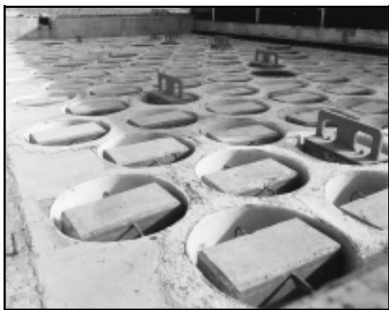
Intermediate Tritium Vault, Savannah River Site

At the request of the Administrator, NNSA, the OIG conducted an expedited review of efforts to construct the Tritium Extraction Facility at the Department's Savannah River Site. The Administrator expressed concerns that the Tritium Extraction Facility may be over budget and behind schedule. The current baseline for the project, established in 1999, provided that the Tritium Extraction Facility was to be completed by February 2006 at a cost of $401 million and that it was to produce 3 kilograms of tritium per year.