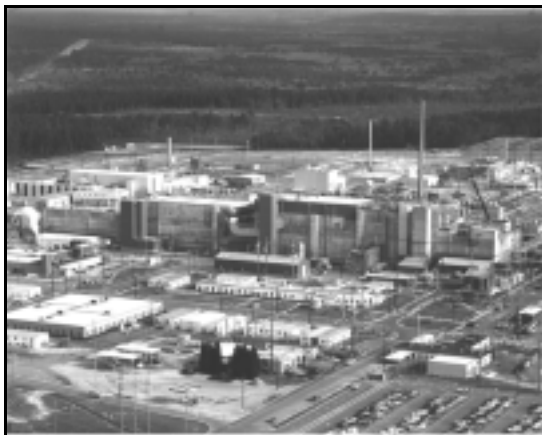
Aerial View of Savannah River's F-Canyon Facility