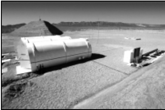
The BEEF Facility, Nevada Test Site

The audit found that it was not necessary to operate this facility on a full-time basis. The OIG determined that the BEEF was operated on a full-time basis despite the fact that it was used to perform only a limited number of detonations, most of which could have been performed at other Department firing facilities. In addition, the OIG concluded that future use of the BEEF will likely decline because potential users of the facility are moving away from large load-type detonations. If the BEEF were used on an as-needed basis, the Department could save $500,000 annually and laboratory personnel could avoid unnecessary travel costs to the Nevada Test Site.