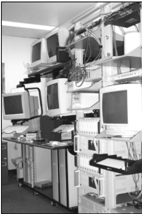
OIG Technology Crimes Computer Forensics Laboratory

The Department was capable of providing the prediction and mapping services to the 18 Department sites; however, these sites had either acquired their own capabilities or had contracted with NOAA for the services. This resulted in unnecessary duplication of atmospheric prediction and mapping capabilities for hazardous materials dispersions at the Department. Also, ARAC was duplicating services for external events that NOAA was capable of providing. For example, both NOAA and ARAC predicted and mapped potential terrorist releases of chemical and biological agents. However, a Federal plan assigned responsibility for such services to NOAA, rather than the Department. The OIG estimated that the Department could save between $1.56 million and $6.18 million per year if duplication was eliminated.