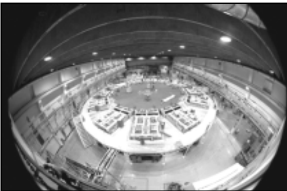
The Atlas Pulsed Power Experimental Facility

The Atlas Pulsed Power Experimental Facility (Atlas) was proposed as part of the Stockpile Stewardship Program to validate certain elements of nuclear weapons computer codes. The facility was completed in August 2000, at a total cost of $49 million. An OIG audit found that although the Office of Defense Programs (DP) validated the need for Atlas and authorized construction, DP did not have the funds to operate the facility. DP had estimated operating costs when construction was authorized; however, it failed to assign the facility a priority high enough to ensure funding. Subsequent to the issuance of the OIG draft report, DP acquired funding to dismantle, move and reassemble Atlas at the Nevada Test Site (NTS). As of the date of the OIG report, the Department had not secured the funding needed to operate Atlas after it is reassembled.