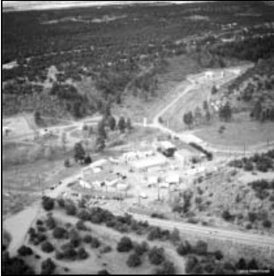
Technical Area-18, Los Alamos National Laboratory

The OIG conducted an inspection of a security incident involving a power failure at the Los Alamos National Laboratory's (LANL) Technical Area 18 (TA-18) that prevented a vault containing a reactor from locking properly. This review found no evidence of any loss, compromise, or unauthorized disclosure of classified information or material. The OIG did find weaknesses, however, in LANL's operating instructions and security procedures relating to the locking of the vault.