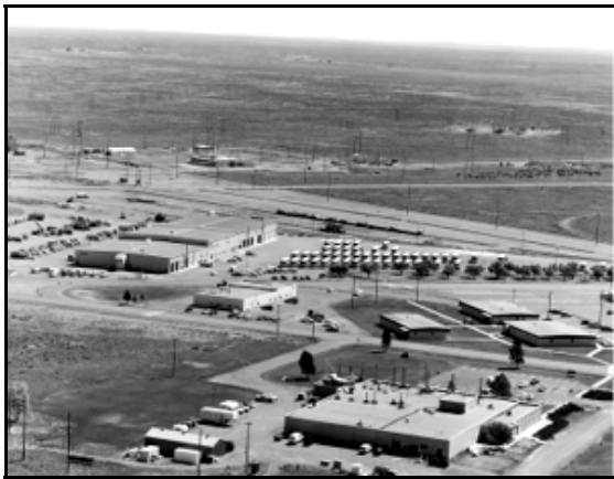
Central Facilities Area, INEEL

The audit found that Idaho did not have an effective maintenance program. Idaho did not ensure that its contractor, Bechtel BWXT Idaho, LLC (Bechtel), developed and implemented a comprehensive site maintenance plan. Without such a plan, Bechtel did not have sufficient oversight over its maintenance program. In addition, Idaho did not incorporate any performance goals or standards into the Bechtel contract to measure the success of maintenance