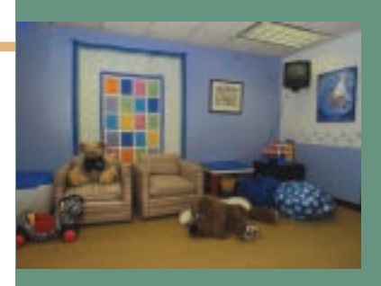
A separate waiting room inside the Milwaukee County Courthouse provides a safe place for victims and their children.