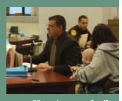
Hearings on bail violations may include testimony from victims or witnesses.

During the hearing, the commissioner weighs the content of the report against arguments presented by the defense and the prosecution, which may include