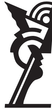
4. Modern Head sculpture