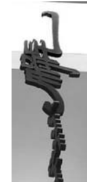
14. Monkeys Grasping for the Moon sculpture, detail