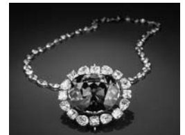
10. Hope Diamond