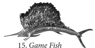
15. Game Fish sculpture