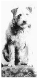
6. Owney, the Postal Dog