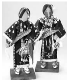
12. Oglala Lakota Dolls