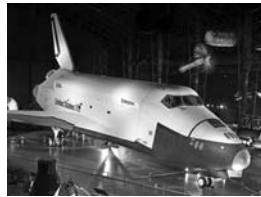
8. Space Shuttle