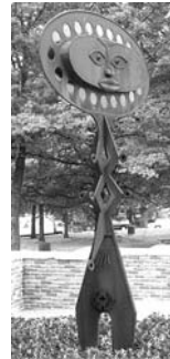
9. Real Justice sculpture