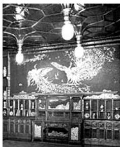
7. Peacock Room, detail