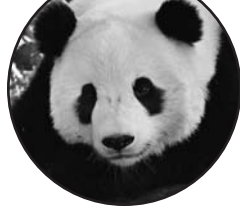
2. Giant Panda