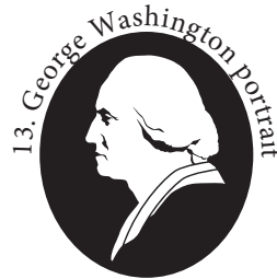
13. George Washington portrait