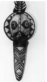
5. Serpent Mask from Burkina Faso, detail