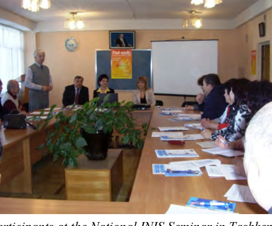
Participants at the National INIS Seminar in Tashkent, Uzbekistan

Currently, the INIS Database contains over 3 million bibliographic records and almost 200 000 full-text nonconventional documents, consisting of scientific and technical reports and other non copyrighted information.