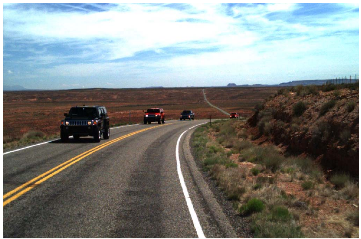
MP 10.7 SR-163 NB