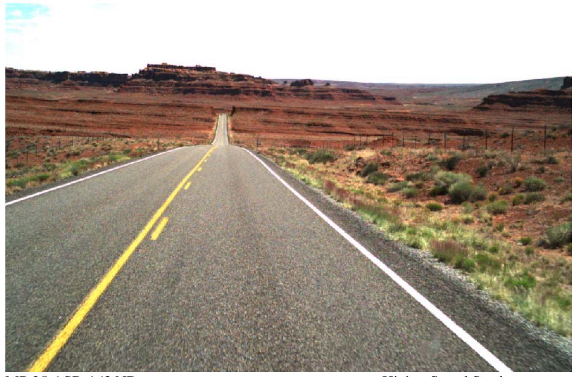
MP 25.6 SR-163 NB