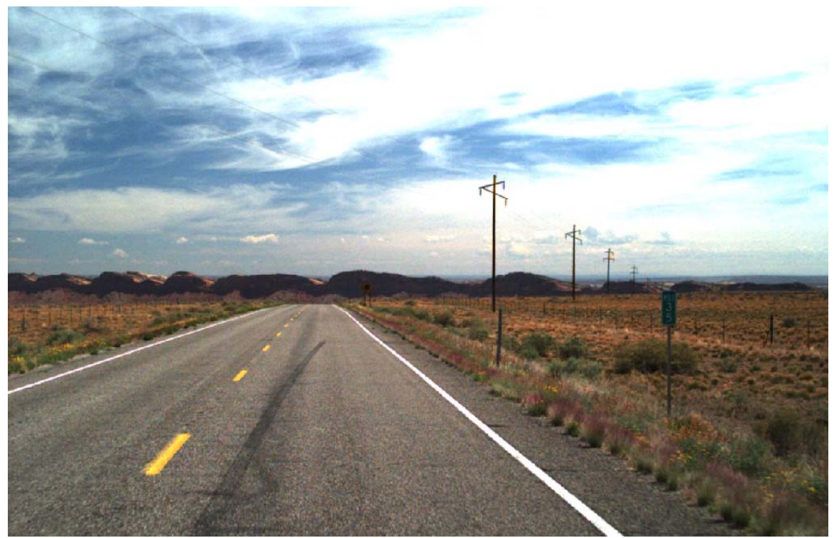
MP 35.0 SR-163 NB