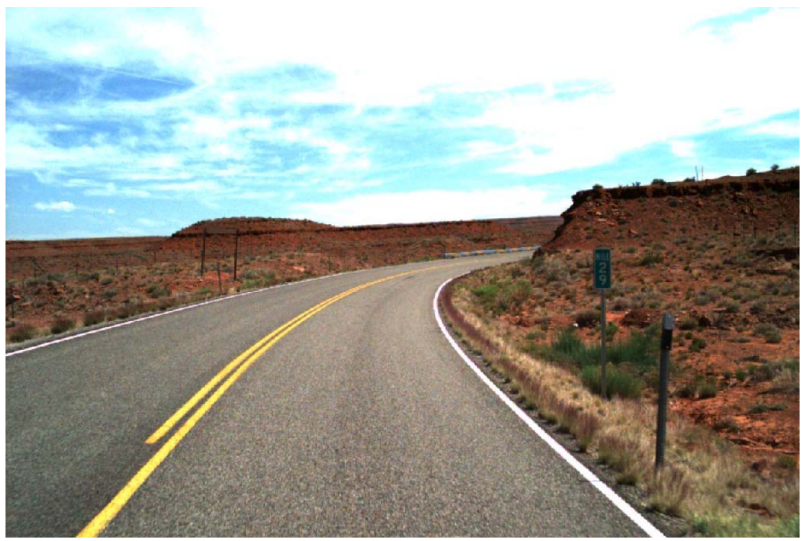
MP 29.0 SR-163 NB