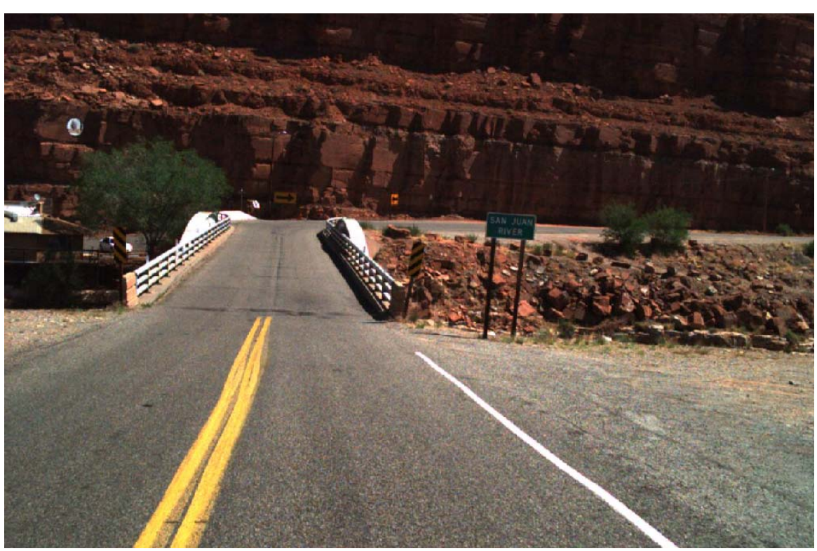
MP 20.9 SR-163 NB