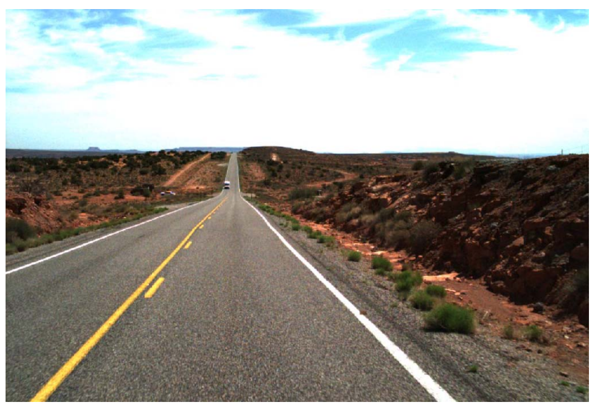
MP 7.2 SR-163 NB