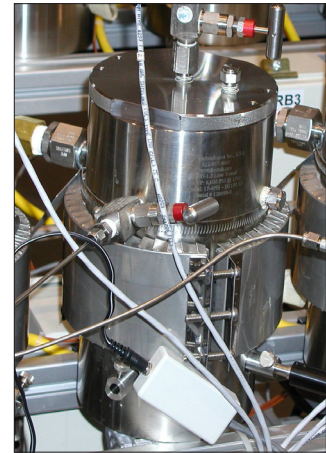
High-pressure vessels for CO 2 exposure