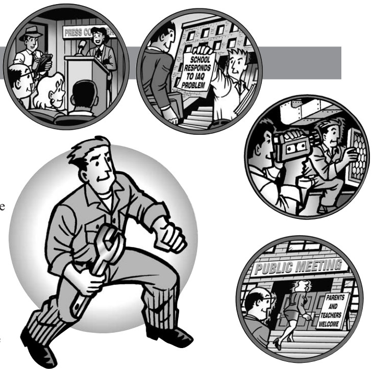
Schools should react to an IAQ crisis quickly and honestly.

Immediately, Saugus Union School District focused on resolving the issue by using EPA’s IAQ TFS Program to guide the gathering of as many facts and environmental data as possible. In addition,