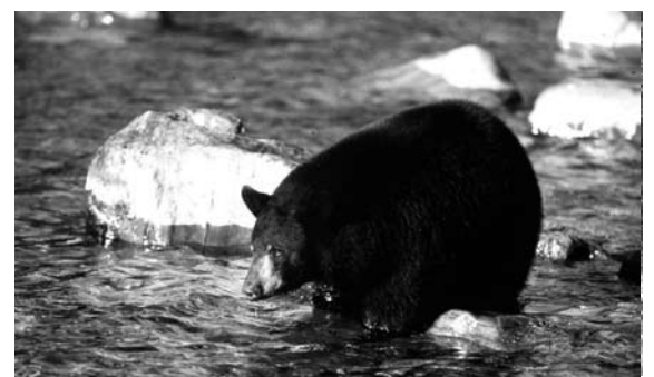
Black bear