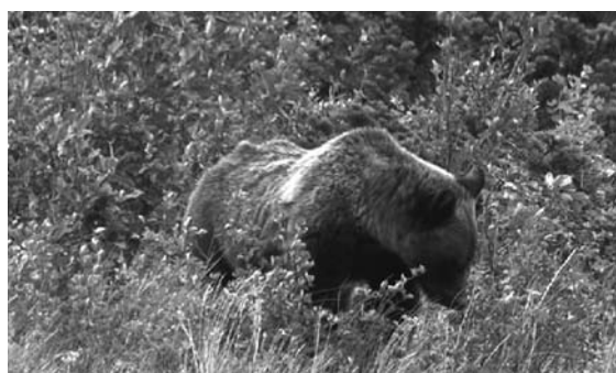
Grizzly bear