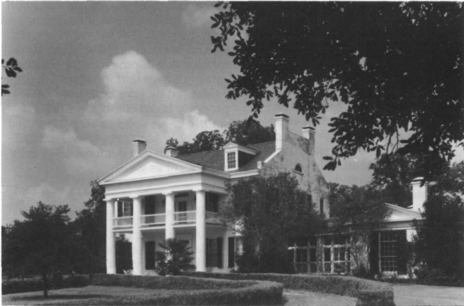
Richland Plantation, East Feliciana Parish, Louisiana. Properties can qualify under Criterion C as examples of high style architecture. Built in the 1830s, Richland is a fine example of a Federal style residence with a Greek Revival style portico. (Photo by Dave Gleason).

Properties may be eligible for the National Register if they embody the distinctive characteristics of a type, period, or method of construction, or that represent the work of a master, or that possess high artistic values, or that represent a significant and distinguishable entity whose components may lack individual distinction.