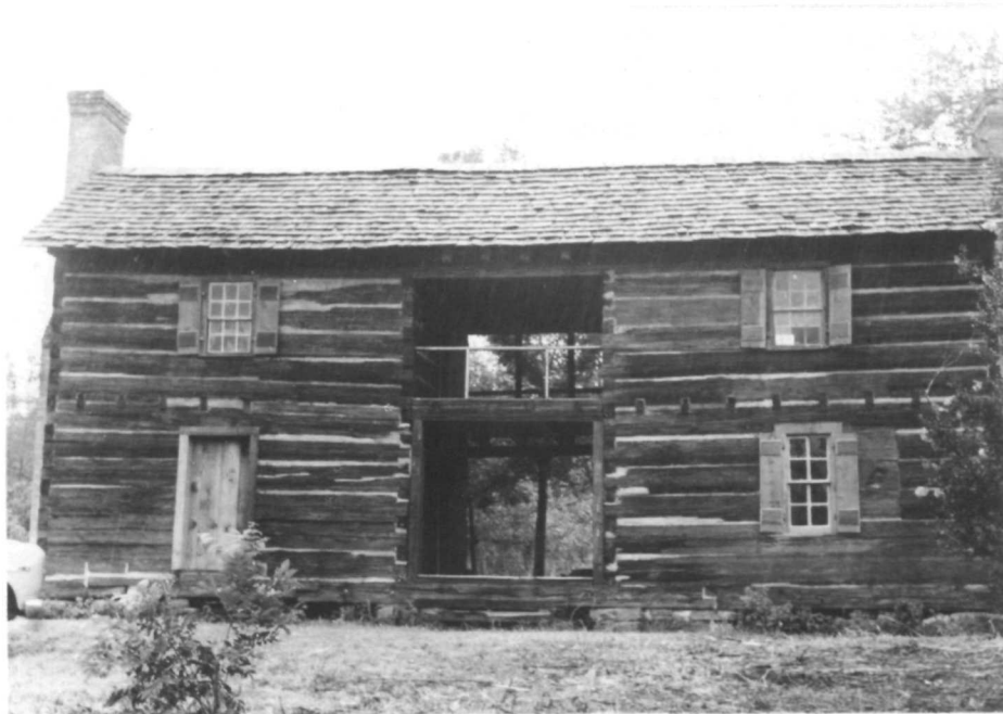
Looney House, Asheville vicinity, St. Clair County, Alabama. Examples of vernacular styles of architecture can qualify under Criterion C. Built ca. 1818, the Looney House is significant as possibly the State's oldest extant two-story dogtrot type of dwelling. The defining open center passage of the dogtrot was a regional building response to the southern climate.