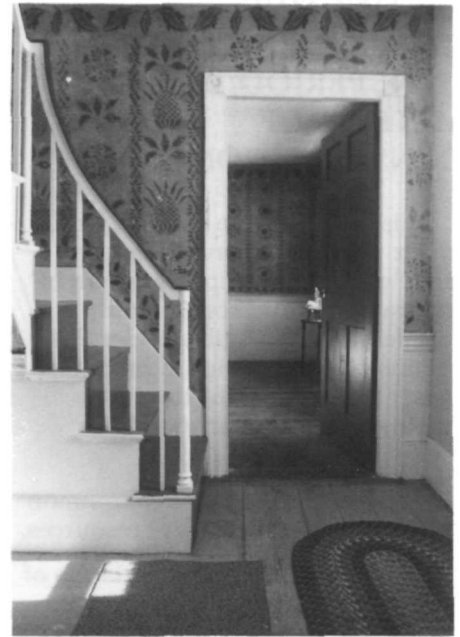
Grant Family House, Saco vicinity, York County, Maine. Properties possessing high artistic value meet Criterion C through the expression of aesthetic ideals or preferences. The Grant Family House, a modest Federal style residence, is significant for its remarkably well-preserved stenciled wall decorative treatment in the entry hall and parlor. Painted by an unknown artist ca. 1825, this is a fine example of 19th century New England regional artistic expression. (Photo by Kirk F. Mohney).

defined within the context of Criterion C. Districts, however, can be considered for eligibility under all the Criteria, individually or in any combination, as is appropriate. For this reason, the full discussion of districts is contained in Part IV: How to Define Categories of Historic Properties . Throughout the bulletin, however, districts are mentioned within the context of a specific subject, such as an individual Criterion.