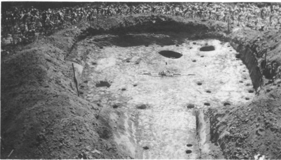
Criterion D - Champe-Fremont 1 Archeological Site, Omaha vicinity, Douglas County, Nebraska. This archeological site, dating from ca. 1100-1450 A.D., consists of pit houses and storage pits which have the potential to yield important information concerning the subsistence patterns, religious and mortuary practices, and social organization of the prehistoric residents of eastern Nebraska.