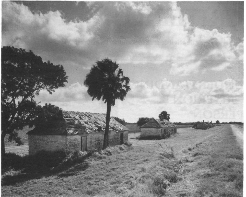
Criterion A - The Old Brulay Plantation, Brownsville vicinity, Cameron county, Texas. Historically significant for its association with the development of agriculture in southeast Texas, this complex of 10 brick buildings was constructed by George N. Brulay, a French immigrant who introduced commercial sugar production and irrigation to the Rio Grande Valley. (Photo by Texas Historical Commission).