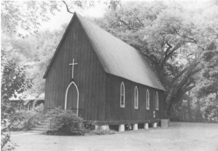
Criteria Consideration A - Religious Properties. A religious property can qualify as an exception to the Criteria if it is architecturally significant. The Church of the Navity in Rosedale, Iberville Parish, Louisiana, qualified as a rare example in the State of a 19th century small frame Gothic Revival style chapel. (Robert Obier)