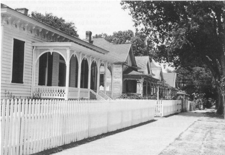
Ordeman-Shaw Historic District, Montgomery, Montgomery County, Alabama. Historic districts derive their identity from the interrelationship of their resources. Part of the defining characteristics of this 19th century residential district in Montgomery, Alabama, is found in the rhythmic pattern of the rows of decorative porches. (Frank L. Thiermonge, III)

business districts canal systems groups of habitation sites college campuses estates and farms with large acreage/ numerous properties industrial complexes irrigation systems residential areas rural villages transportation networks rural historic districts