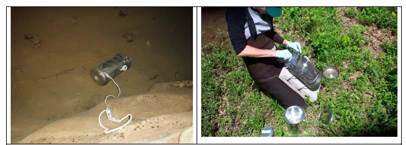
Figure 2. Deployment of a stainless steel canister in a cave (left) and at one of the surface sites (right).