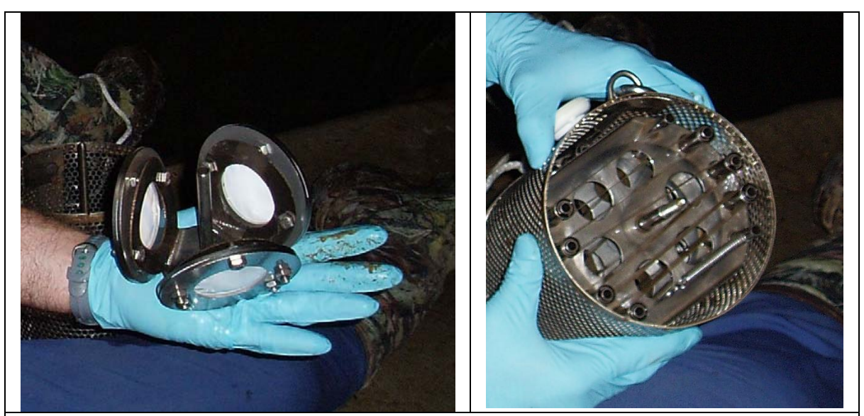
Figure 1. POCIS (left) and SPMD (right) sampling membranes deployed at the cave and surface water sites.