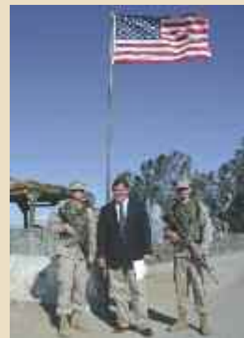
REP. CALVERT meets with Marines at Camp Pendleton to discuss ongoing operations in Iraq and Afghanistan and thank them for their service.

Contact Representative Ken Calvert at one of the following addresses or through his website www.calvert.house.gov :