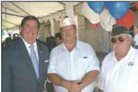
REP. CALVERT meets with local veterans to discuss the war in Iraq and veterans benefits.

"There are countless stories from every war in our history of unimaginable sacrifices. Many go unnoticed except by those who survive those perilous moments. Our military is not boastful. Most would probably prefer the quiet approval of their fellow soldiers than a parade in their honor. However, today on Veterans Day we do not let them escape without knowing our Nation's gratitude. We recognize them, we thank them, we wave the American flag and we hold ceremonies in their honor. It is the least we can do and yet it pales in comparison to all that our veterans have done for us."