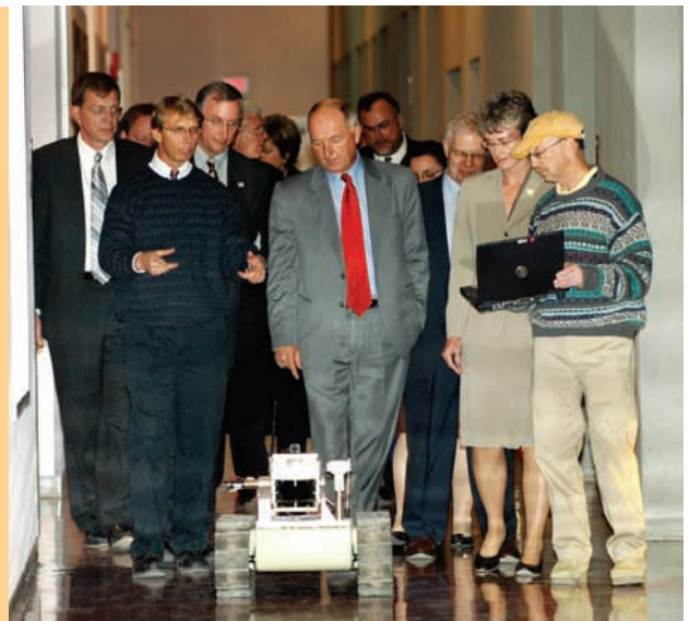
ROBO TECH: U.S. Reps. Pete Hoekstra, R-Mich. (center), and Heather Wilson, R-N.M.(right of Hoekstra), watch a robot demonstration at Sandia National Laboratories in Albuquerque. A briefing on technologies developed at NNSA's national labs and by local technology companies that could soon play a role in U.S. military and counterterrorism activities was also provided. Hoekstra is chairman of the House Permanent Select Committee on Intelligence. Wilson serves on the Intelligence Committee and chairs its Subcommittee on Technical and Tactical Intelligence.