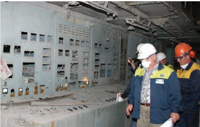
BEFORE: The initial inspection team, which included Washington Group International, Inc. (WGII) and Rosatomstroy specialists, found the Seversk Central Thermal Electrical Plant to have a talented and committed workforce nursing energy from an aged and deteriorating plant.