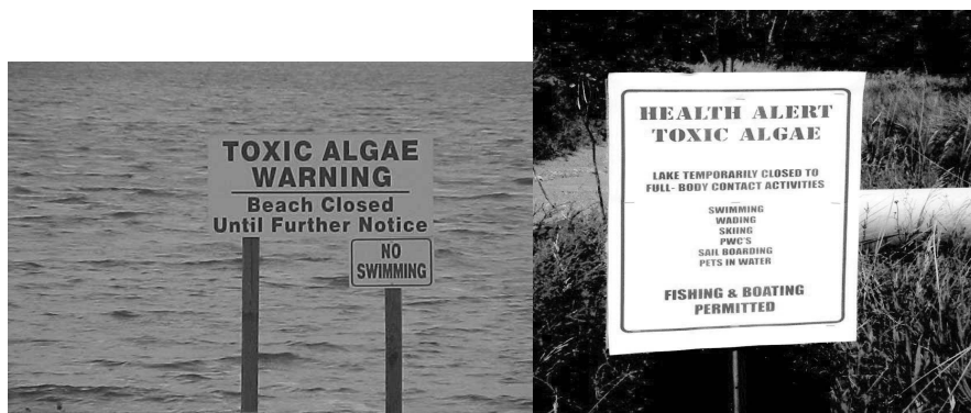
Fig. 3. Posting of warning signs at lake beaches and boat ramps. (See Color Plate 4).