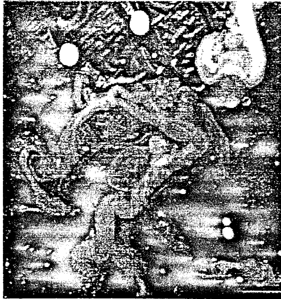
The healthier you are, fewer you will have!

Are you ready to rid yourself of Parasites?