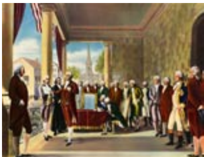
George Washington takes the oath of office as first president of the United States, 1789. Washington distrusted political factions, but popular parties began their rise under his presidency.

Baltimore, Maryland, to choose candidates and write a platform on which they would run. The next year, the Democrats met in the same saloon to select their nominees. Since then, the major parties and most minor parties have held national nominating conventions, attended by state delegates, to choose their