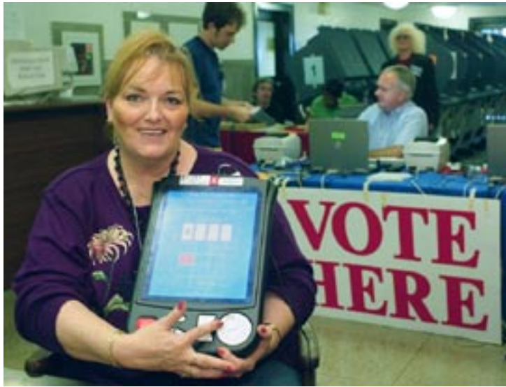
An election clerk displays a new voting device in Austin, Texas.

Recently, there has been a tendency to ease registration requirements. For instance, the 1993 National Voter Registration Act makes it possible for citizens to register to vote at the time they renew their state-issued drivers' licenses.