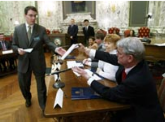
Here, the Washington state electoral college casts its 11 votes in 2004 for Democratic presidential candidate John Kerry.

awarded on the basis of state elections could produce a different result than the nationwide popular vote. In fact, there have been 17