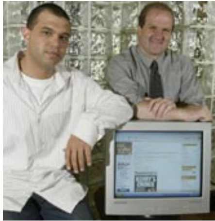
Increasingly, the Internet is used to raise money and to gain attention for long-shot candidates. An Ohio congressional candidate (right) and his communications director (left) pose and show off their blog page.

Both of these trends have forced candidates to begin their campaigns earlier to gain a foothold in the increasing number of states that hold the early contests. Candidates also have had to depend increasingly on the mass media — radio, television, and the Internet — and on the endorsements of state party leaders to help them reach voters in the multiple states that may be conducting their primaries on the same day.