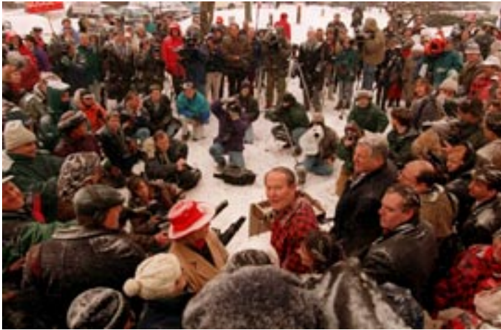
State-by-state primary elections (or sometimes caucuses) have become the road to the Republican and Democratic presidential nominations. Here, a Republican presidential aspirant, Lamar Alexander (checked shirt, center), greeted media and New Hampshire primary voters in winter, 1996.

their own living rooms. Plausible candidates for the presidency could use television exposure to demonstrate their popular appeal. The decades that followed brought back democratizing reforms to widen participation in party nominating conventions.