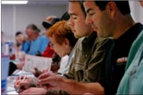
Voters fill out paperwork before casting their ballots, San Diego, 2004.

E lections occur in every even-numbered year for some federal and most state and local government offices in the United States. Some states and local jurisdictions hold elections in odd-numbered years.