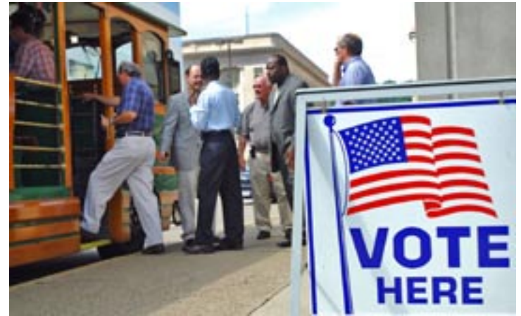
Voters leave a polling place in West Virginia. This group of pastors came to vote against a ballot measure to expand legalized gambling.

F ederal law dictates how candidates for the federal offices of president, senator, and representative — and certain of their political allies — may raise funds, as well as from whom,