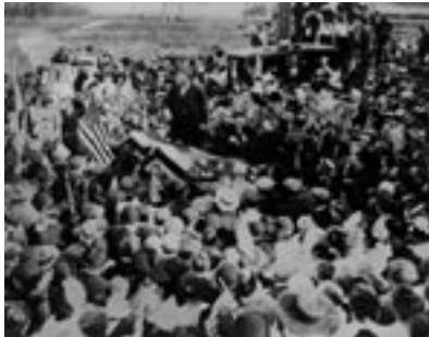
Third-party presidential candidates have arisen several times in the 20th century. Though they have not won, they have influenced presidential elections. In this photograph, former president Teddy Roosevelt makes a speech to his own “Bull Moose” party supporters, 1912.

or be absorbed into one of the major parties. Since the 1850s, only one new party, the Republican Party, emerged to achieve major party status. In that instance, there was a compelling moral issue — slavery — dividing the nation. It provided the basis for candidate recruitment and voter mobilization.