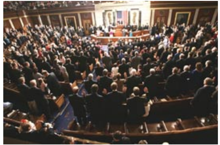
Members of the 109th Congress take their oath of office in the House chamber on Capitol Hill, 2005.

Unlike proportional systems popular in many democracies,