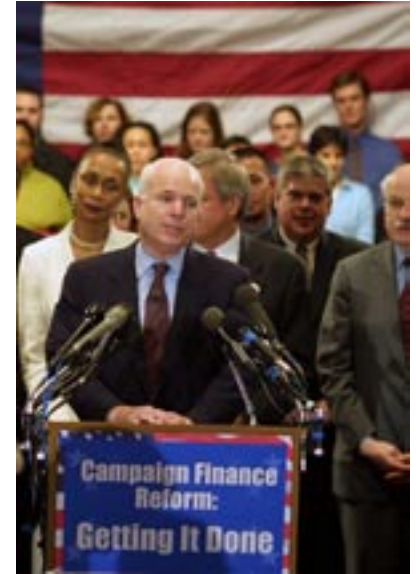
Republican Senator John McCain has spent much effort trying to reform campaign finance. What constitutes desirable reform is still debated.

To campaign for office, a candidate needs to hire staff; arrange for office space and travel; conduct research; issue position papers; advertise on radio and television, in publications, and on the Internet; and conduct numerous public appearances and fundraising events. A candidate for the House of Representatives will base these activities in his or her specific congressional district, while