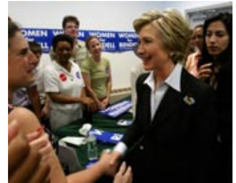
Top: Republican presidential hopeful for 2008 Rudolph Giuliani signs autographs in Bluffton, South Carolina. Bottom: Democratic presidential hopeful (2008) Hillary Clinton visits with supporters in Narberth, Pennsylvania.