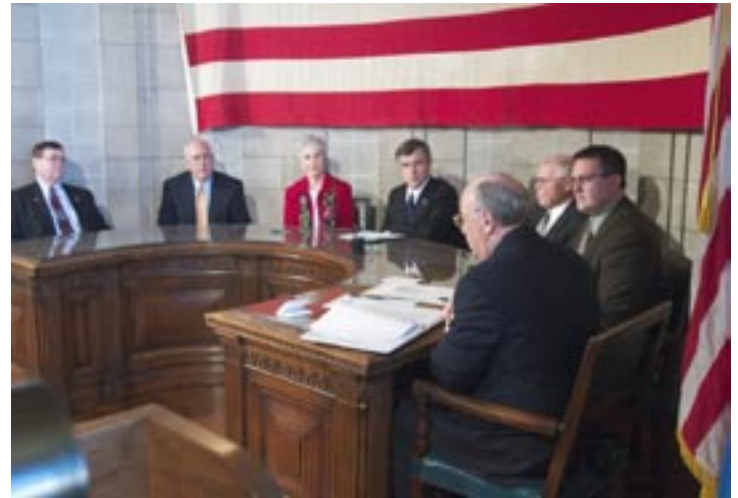
Nebraska’s Electoral College meets in December 2004, in Lincoln, Nebraska, to cast the state’s five electoral votes for President George W. Bush.

The absolute majority requirement makes it extremely difficult for a third-party candidate to win the presidency because the individual states’ electoral votes are allocated under a winner-take-all arrangement (with two exceptions). That is, whichever candidate receives a plurality of the popular vote in a state — even if it is just a narrow plurality — wins all of that state’s electoral votes. In Maine and Nebraska, the statewide