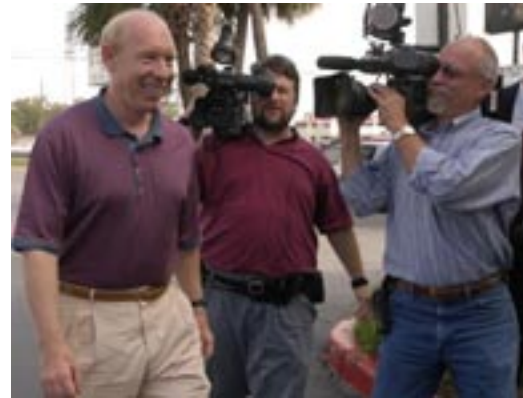
In the layered U.S. federal system, local elections are as important as national elections to local citizens. Here, Houston mayoral candidate Bill White makes a media appearance.

In addition to being ideologically flexible, the two main American parties are characterized by a decentralized structure. Once in office, a president cannot assume that his party's members in Congress will be loyal supporters of his favored initiatives, nor can party leaders in Congress expect straight party-line voting from members of their party. The Democratic and Republican congressional caucuses (composed of incumbent legislators) are autonomous, and may pursue policies that are in opposition to the president, even if the president is from the same party. Party fundraising for elections is similarly separated, as the Republican and Democratic congressional and senatorial campaign committees operate independently from the national party committees that tend to be oriented to the presidential election. In addition, except for asserting authority over procedures for selecting delegates to national nominating conventions, national party organizations rarely meddle in state party affairs.