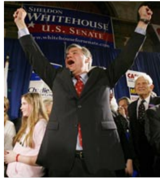
Democrat Sheldon Whitehouse celebrates his election as a U.S. senator from Rhode Island. Both senators and congressmen wield significant power.

Unlike a parliamentary system where the chief executive comes from the parliament, the American system, as noted, separates the legislature and the presidency. Presidents and legislators are elected separately. Although a sitting president may propose laws to Congress, they have to be drafted in Congress by his allies within that institution, and must be passed by the Congress before being sent back to the president