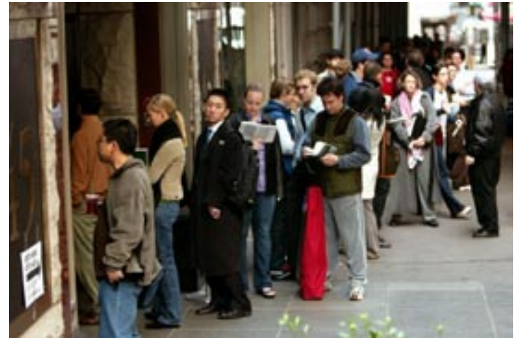
Voters wait patiently to cast their ballots during a voting machine breakdown, New York City, 2004.

Thus, a certain effort goes into fair, legal, and professional preparation for elections. Since the equipment and ballot forms are generally purchased by officials at the local level, the type and condition of equipment that voters use often is related to the socioeconomic status and the tax base of their locale. Since local tax revenue also funds schools, police, and fire services,