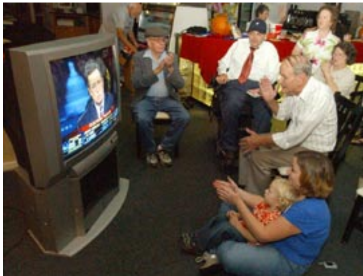
Television after World War II made national elections popular entertainment. Here, party loyalists gather to watch election returns at Republican headquarters in Meridian, Mississippi.

But democratizing pressures reemerged after World War II. For the first time, television provided a medium through which people could now see, as well as hear, the political campaigns in