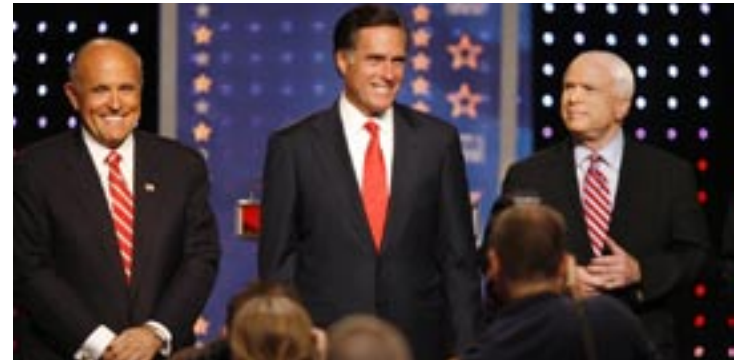
Three men hoping to win the Republican presidential nomination in 2008 (left to right): Rudolph Giuliani, Mitt Romney, and John McCain, pose prior to a nationally televised debate. Though party primary elections are state-by-state, national debates influence voters in all state primaries.

The Twenty-Second Amendment to the U.S. Constitution,