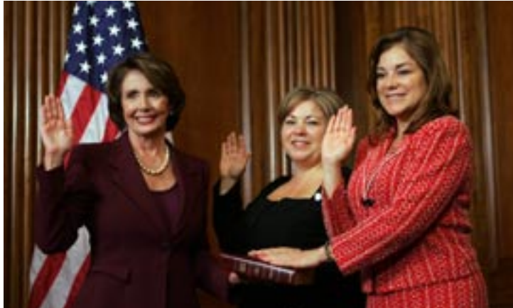
Speaker of the House of Representatives Nancy Pelosi (left) swears in two sisters, Linda (center) and Loretta Sánchez, both elected to the House from California.

The House and the Senate have nearly equal powers, but their means of election are quite different. The founders of the American Republic intended members of the House of Representatives to be close to the public, reflecting the public's wishes and ambitions. Therefore, the Founders designed the House to be relatively large in order to accommodate many members from small legislative districts, and to have frequent