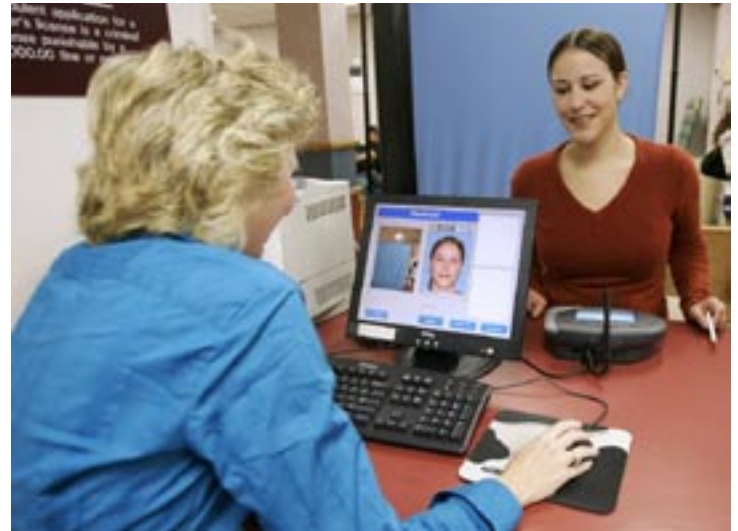
A young woman in Rhode Island signs up to get her driver's license and registers to vote, simultaneously.

One of the most important functions for election officials is ensuring that everyone who is eligible to vote is on the registration lists but that no one who is unqualified is included. Generally, local election officials err on the side of keeping people on the lists even if they have not voted recently, rather than eliminating potentially eligible voters. When people appear