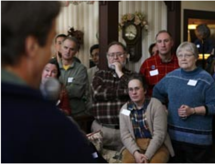
Voters in New Hampshire listen to Democratic presidential aspirant John Edwards in a private house in Salem, early in the 2008 primary season.

it, generally, unnecessary for dissidents to engage in the difficult business of forming a third party. Furthermore, the parties and their candidates tend to adapt electoral strategies to co-opt the message of third party and independent candidates who demonstrate wide appeal.