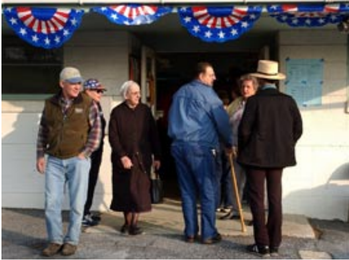
Voters in rural Pennsylvania (including members of the Amish community) enter and exit a polling place.

questionable use in projecting winners early on election day, they provide experts and political scientists with details of how specific demographic groups have voted and the expressed reasons for their vote.