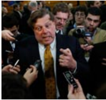
Mark Penn, chief strategist and pollster for Democratic presidential candidate Hillary Clinton, speaks to reporters following a debate in January 2008.

independent political polling has offered an objective look at election races, an assessment of each candidate's strengths and weaknesses, and an examination of the demographic groups supporting each candidate. Such independent polling gives reporters and editors the ability to make and report honest assessments of the status of a campaign, and voters a better sense of the political landscape.