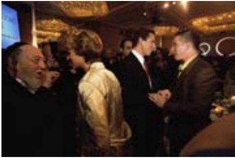
New York politician Andrew Cuomo (center) chats with supporters at a fundraising affair during his campaign for governor.

name, the FEC only supervises and enforces campaign finance laws; it does not actually conduct the elections. (The process of registering voters, conducting the balloting, and counting the votes