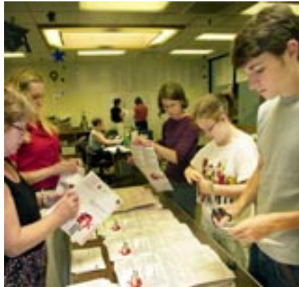
The state of Washington has permitted citizens to place initiatives on the voter ballot since 1912, if enough voters sign a petition requesting it. Here, volunteers favoring an education initiative open and sort petitions in Seattle.

In the United States, elections may involve more than just choosing people for public office. In some states and localities, questions of public policy may also be placed on the ballot