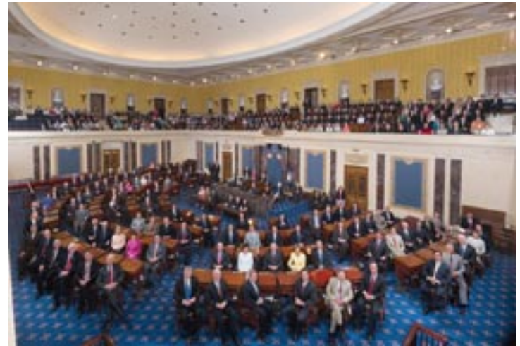
The upper house of Congress, the Senate, was designed by the Founders to be a conservative, stabilizing force. Here, the 100 senators pose for their portrait.

(two-year) elections. Originally, a two-year term was considered by some to be too long. In the days when transportation was by horse, a two-year term in Washington could keep a congressman away from his constituents for two years. Today, the concern is that elections every two years force congressmen to fly back to their districts every weekend or so to shore up political support.