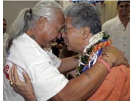
Senator Daniel K. Akaka (D) of Hawaii (right), gives traditional greetings to a supporter at his campaign headquarters in Honolulu.

centrist policy positions. As noted, they also demonstrate a high level of policy flexibility. This non-doctrinaire approach enables the Republicans and the Democrats to tolerate great diversity