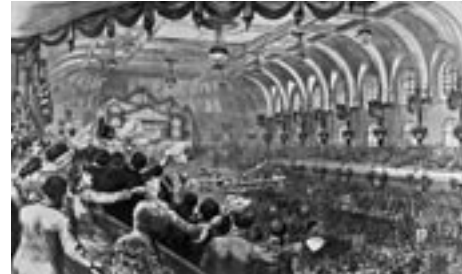
Nominating conventions are an old U.S. political tradition. Top, delegates to the Republican convention, Chicago, 1868. Bottom, national Democratic party convention, Cincinnati, 1880.

the Congress, the governorships, and the state legislatures. For instance, every president since 1852 has been either a Republican or a Democrat, and in the post-World War II era, the two major parties' share of the popular vote for president has averaged close to 95 percent. Rarely do any of the 50 states elect a governor who is not a Democrat or a Republican.