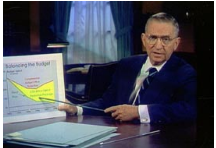
In 1992, Texas billionaire Ross Perot became concerned about federal budget deficits and ran a third-party presidential campaign, detailing his views on television. Some say his legacy was the election of Bill Clinton as president.

There is evidence that third parties can have a major impact on election outcomes. For example, Theodore Roosevelt’s third-party candidacy in 1912 split the normal Republican vote and enabled Democrat Woodrow Wilson to be elected with less than a majority of the popular vote. In 1992, H. Ross Perot’s independent candidacy attracted voters who, in the main, had been voting Republican in the 1980s, and thereby contributed to the defeat of the incumbent Republican president, George H.W. Bush. In the extremely close 2000 contest between Republican George W. Bush and Democrat Al Gore, it is possible