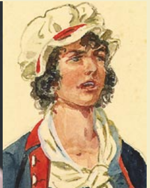
Margaret Corbin, illustration by Herbert Knotel.

In the stories of Abigail Adams and Margaret Corbin, we see that women in the revolutionary era were as ardently patriotic as the men and were equally determined to enjoy “liberty and the pursuit of happiness.” Adams with a pen and Corbin behind a cannon showed that women were valuable partners in the creation of a democratic nation that today guarantees equal rights to all its citizens.