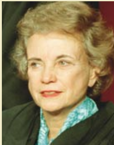
Sandra Day O'Connor