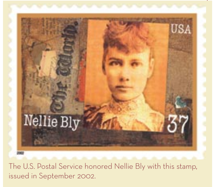
The U.S. Postal Service honored Nellie Bly with this stamp, issued in September 2002.

In 1887, Bly became a reporter for the New York World . There, she pioneered investigative journalism, or, as it was often called, “muckraking” — exposing corruption, crime, and abuse. She had herself committed to a woman’s asylum and, once she left, wrote articles that revealed the horrors in the treatment of the mentally ill. “The insane asylum on Blackwell’s Island is a human rat trap,” Bly concluded. “It is easy to get in, but once there