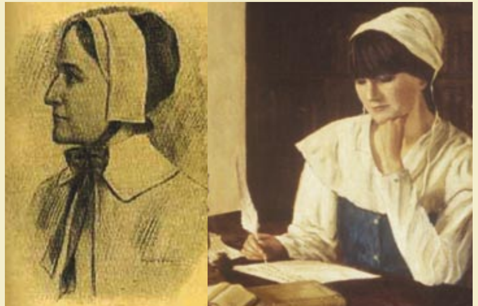
Anne Marbury Hutchinson

The thousands of women colonists of this era made huge contributions to the settlements of the New World. They raised children and educated them as they cleared the wilderness alongside their husbands, built cabins, and made or traded basic necessities. Women were the mainstays of church and community.