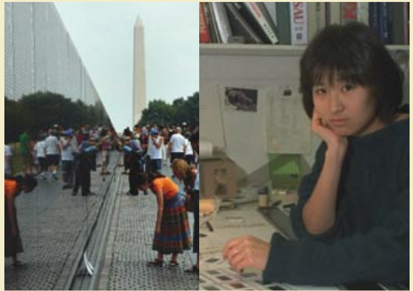
Left, visitors look at the names inscribed on the wall of the Vietnam Veterans Memorial in Washington, D.C. Right, Maya Lin in her New York office.

Since that first famous project, Lin — born in Athens, Ohio, of Chinese immigrant parents — has designed many other significant works that often combine her skills as an architect and a sculptor. Her Civil Rights Memorial in Montgomery, Alabama, in the form of a wall and flat disk over which water flows, was inspired by Martin Luther King Jr.’s “I have a dream” speech. Lin used water as its principal feature, drawing on King’s words: “We are not satisfied and we will not be satisfied until justice rolls down like waters and righteousness like a mighty stream.” The Langston Hughes Library in Clinton, Tennessee; the Museum for African Art in New York City; a line of furniture for the Knoll company called “The Earth Is (Not) Flat”; and another memorial, The Women’s Table at Yale University, are some of her other works.