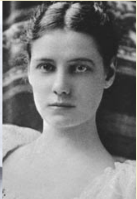
'Nellie Bly' (Elizabeth Cochrane Seaman)

Over the course of American history, women have dedicated many years to achieving rights and gaining opportunities most men had taken for granted, from the right to vote to equal access to an education and a paying job.