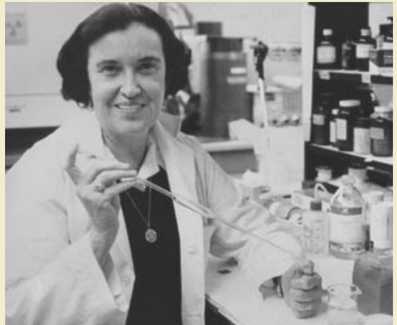
Dr. Rosalyn Yalow at her Bronx Veterans Administration Hospital, October 13, 1977, after learning she was one of three American doctors awarded the Nobel Prize for Physiology or Medicine that year.

After receiving the Nobel, Yalow hosted a five-part dramatic TV series on the life of a famous forerunner, Polish-born physical chemist Marie