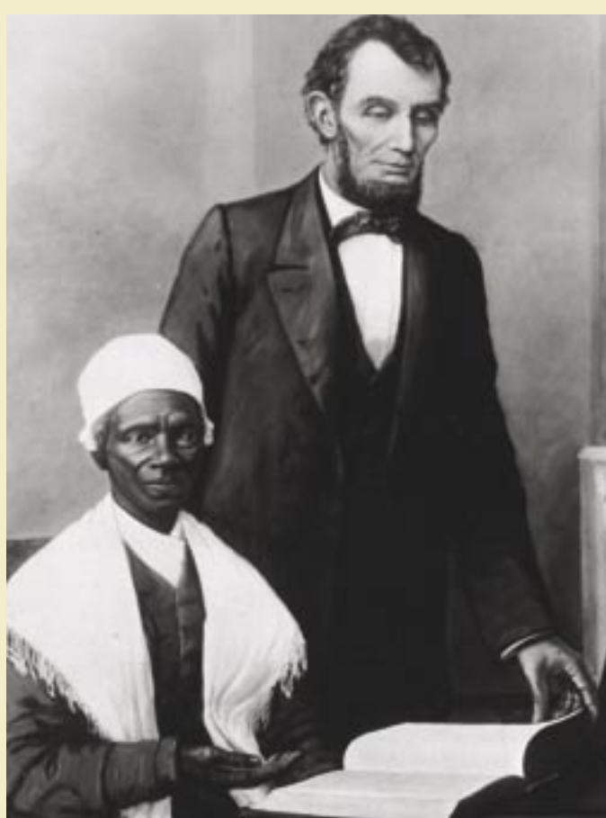
Abraham Lincoln reading the Bible with abolitionist Sojourner Truth. Baltimore's black community presented this print to the president to commemorate the Emancipation Proclamation.

During the Civil War she gathered supplies for black volunteer regiments and she was involved in various political causes. In tribute to her efforts, President Lincoln received her at the White House in 1864. She was appointed to the National Freedman's Relief Association in the same year, where she worked to better conditions for all African Americans.