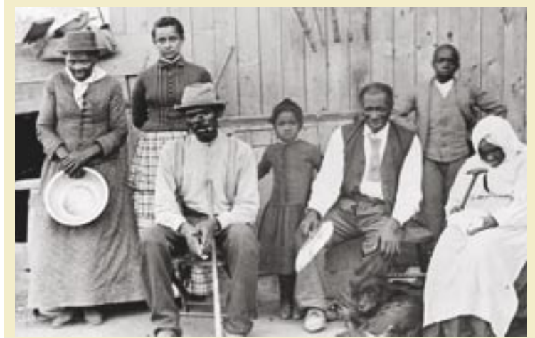
Harriet Tubman, far left, whose talents as Underground Railroad scout freed 300 slaves before the Civil War.

Owing to inefficiency and perhaps lingering racial discrimination, Tubman was denied a government pension after the war and struggled financially for many years. She pressed to advance the status of women and blacks, to shelter orphans and elderly poor people.