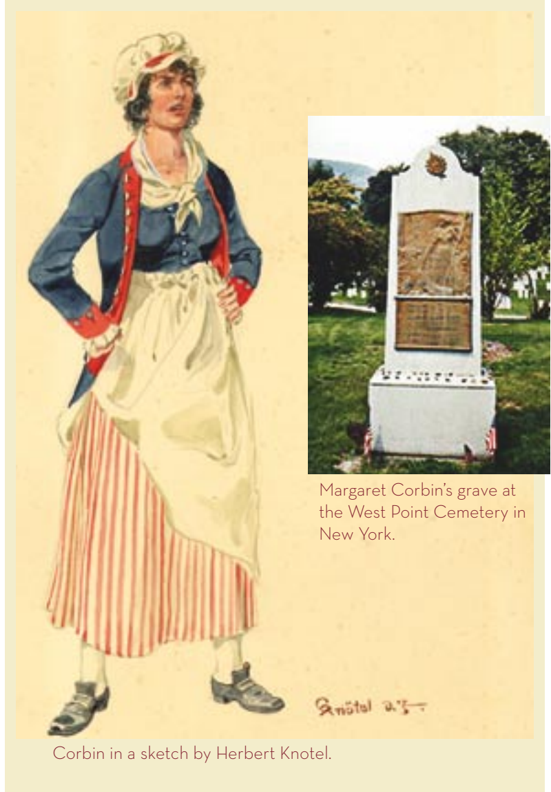
Corbin in a sketch by Herbert Knotel.

Her fellow soldiers took her to a hospital in Philadelphia, but she never fully recovered from her wounds, and was left with a disabled left arm. In recognition of her bravery, the Continental Congress granted her a lifetime soldier’s half-pay pension. She was formally mustered out of the Continental Army in April 1783. Known by neighbors as “Captain Molly,” she died near West Point, New York, probably before her 50th birthday. In 1926, the Daughters of the American Revolution re-interred her remains at the U.S. Military Academy at West Point. A bronze plaque to “the first American woman to take a soldier’s part in the War for Liberty”