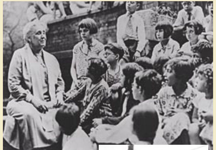
Above, Jane Addams never lost her concern for children and devoted much of her energy to meeting their needs. Right, Hull House in Chicago, Illinois, shown here on July 10, 1946.

Addams directed her talents and unflagging energy to other causes, including women's suffrage, politics (seconding Theodore Roosevelt's nomination by the Progressive Party in 1912), and as a