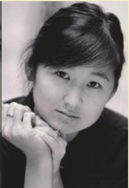
Maya Ying Lin

professions previously considered out of bounds to their sex. Disparities remain, but women's progress in many areas has been remarkable. Two statistics from the last U.S. Census Bureau illustrate this development. In education, women are expected to earn 59 percent of the bachelor's and 60 percent of the master's degrees awarded for the school year 2005-06. Businesses headed by female entrepreneurs had receipts of $940.8 billion in 2002.