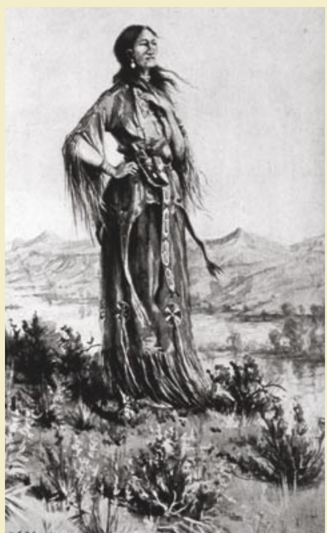
Sacagawea, from a drawing by E.S. Paxson.

Following the expedition, Sacagawea and her husband lived for a time in St. Louis before returning to the Dakotas. She is widely believed to have died in 1812, although an elderly woman claiming to be Sacagawea passed away in 1884. In 2000, an artist’s imaginary rendering of Sacagawea cradling her son was added to U.S. currency on a dollar coin.