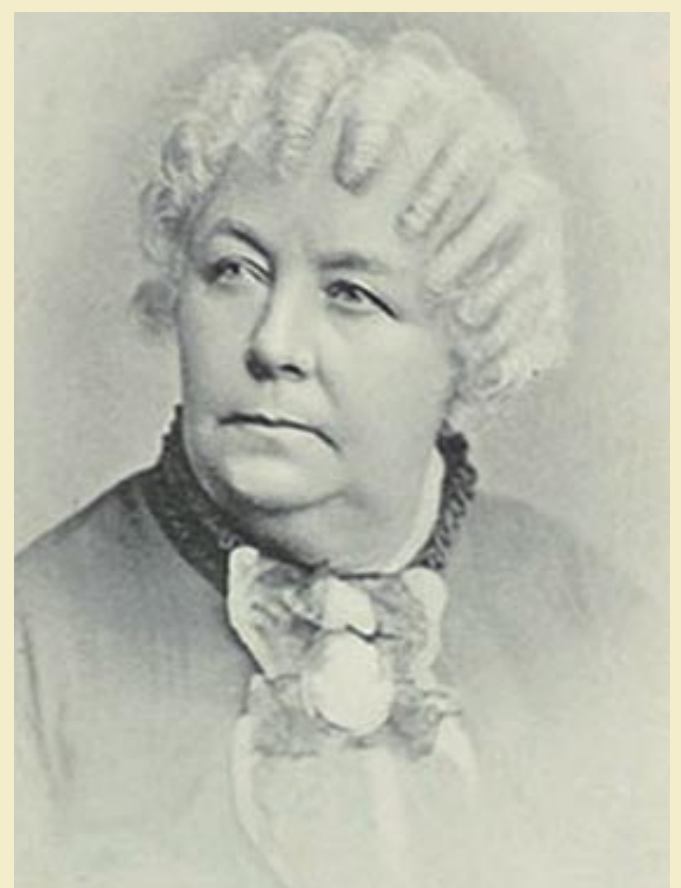
Elizabeth Cady Stanton, in a photo from her book, Eighty Years and More: 1815-1897 .

Around 1850, Stanton began her association with Susan B. Anthony, also a leader in the movement to give women the right to vote. Their 50-year-long collaboration benefited from Stanton’s skills as the better orator and writer and Anthony’s as the organizer and tactician. “I forged the