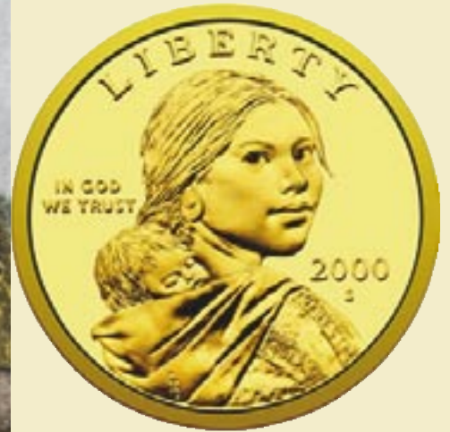
The Sacagawea gold dollar coin, first minted in 2000.

Both women would act as beacons, literally and figuratively, to the settlers they encountered. While still a child, Pocahontas would serve as a bridge between the first European arrivals and local Indian tribes, saving the life of one explorer and acting as a go-between during times of tense relations between the two groups. Sacagawea would take part in the first U.S. expedition to map the lands west of the Mississippi. She lent her skills in tribal languages and knowledge of western territories to guide the first American explorers safely to the Pacific and back.