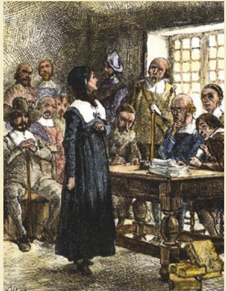
Woodcut depicting Anne Hutchinson's sentencing to be banished from the Massachusetts Bay Colony.