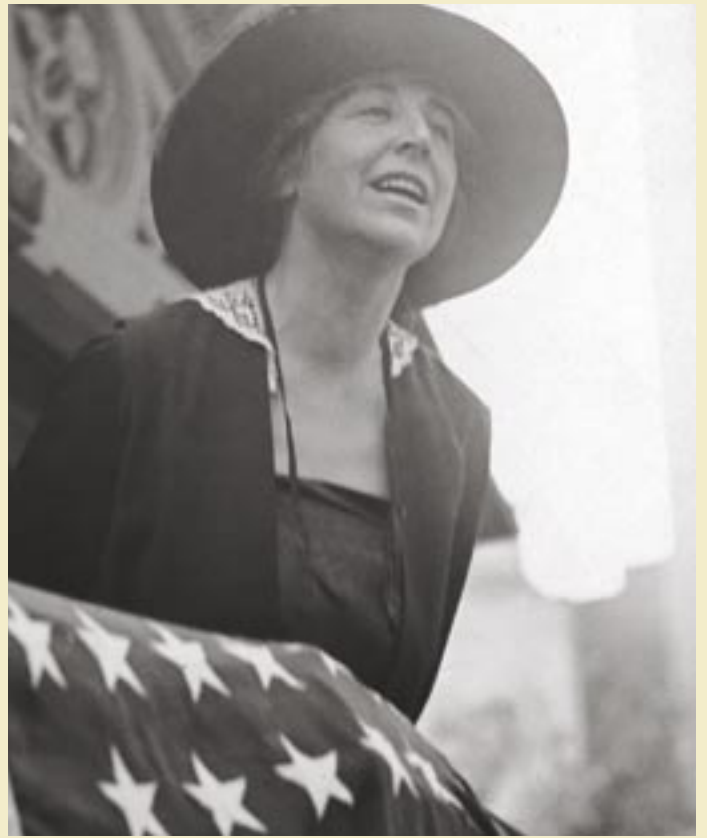
Jeannette Rankin addresses a rally at Union Square, New York, September 1924.

Rankin returned to social work and to reform organizations, such as the National Consumers' League, the Women's International League for Peace and Freedom, and — in 1919 — attended the Second International Congress of Women in Zurich. Re-elected to Congress in 1940, she cast the only vote in Congress against war on Japan after the attack on Pearl Harbor. With her political career ended by this unpopular vote, Rankin