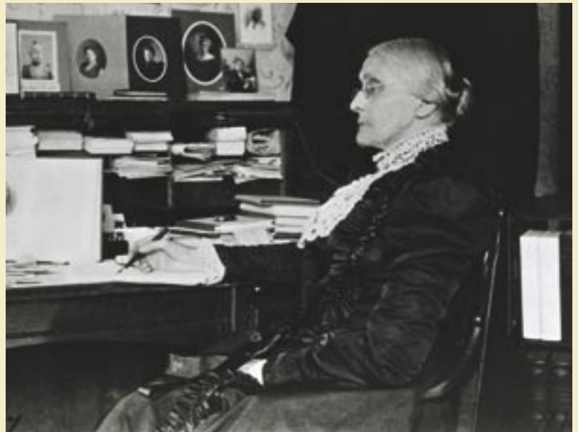
Susan B. Anthony, 1899.

Unlike Stanton, Anthony never married, and put all her time and energy into political organizing. Anthony worked as a member of the American Anti-Slavery Society from 1856 until the outbreak of the U.S. Civil War in 1861 and continued to work for slaves’ emancipation during the war. With Stanton, she engaged in petition drives for women’s rights, founded a progressive magazine, The Revolution , and helped organize the New York Working Women’s Association. With the adoption in 1870 of the 15th Amendment, all citizens were guaranteed the right to vote regardless of “race, color, or previous condition of servitude,” but not regardless of gender. Appalled at this situation, Anthony took direct action, leading a group of women to the polls in Rochester.