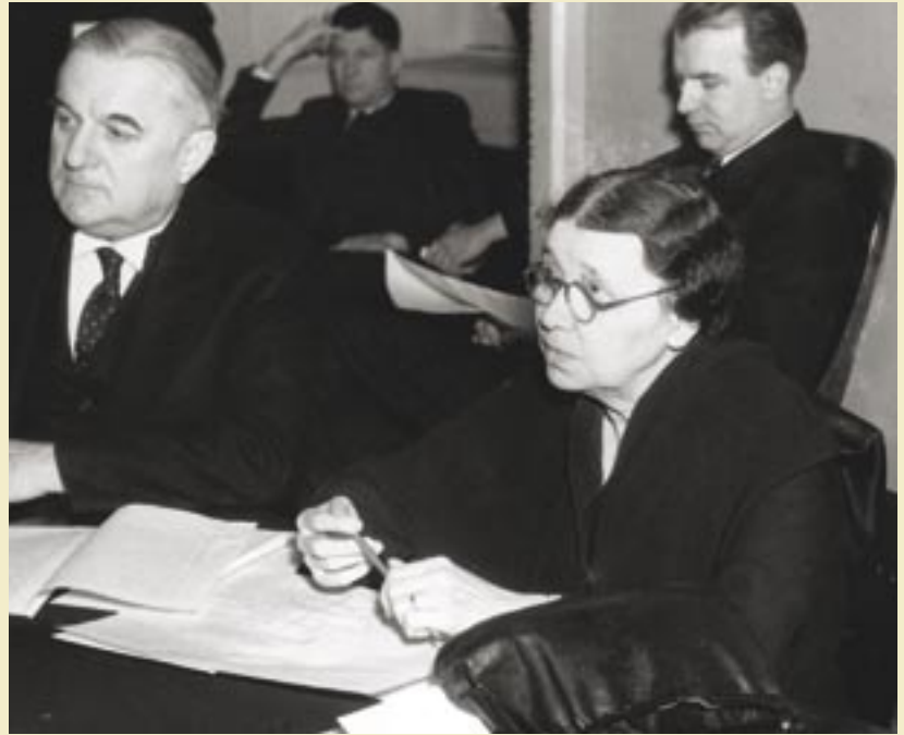
Sen. Hattie Caraway, shown with Sen. Joseph Guffey (left), as she becomes the first woman to preside over an open meeting of a Senate Committee in Washington, D.C., February 26, 1936.

"Silent Hattie" spoke up and took everyone by surprise on May 9, 1932. Invited to become the first woman to preside over the Senate, she announced to the reporters gathered for the event that she was running for re-election. She won that election, thanks in part to Senator Huey Long of Louisiana, who campaigned hard for her. In the 1940s she