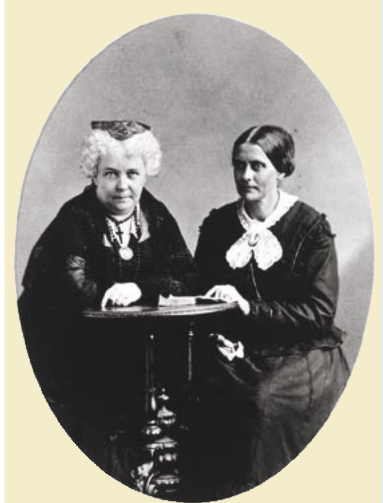
Left, Elizabeth Cady Stanton and right, Susan B. Anthony, c. 1870s.

The political insight of Stanton and her equally famous partner in the 19th-century women's rights movement, Susan B. Anthony, was that in order to change society, you have to change public opinion first. Both women were bent on propagating ideas: Stanton through her writing, Anthony through personal leadership and extensive lecture tours. In addition, both women realized that freedom and liberty for some groups essentially means freedom and liberty for all groups. Arguing for the abolition of Negro slavery, they aimed to convince Americans in the late 19th century that women, like former slaves, deserved well-defined and legally protected rights.