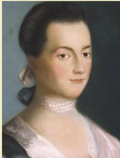
Portrait of Abigail Adams by Benjamin Blythe, 1766.

American women played a large, if until recently often unacknowledged, role during this era. Many tended the family farms and businesses while the men were fighting the war or fashioning the peace. Others went to battle side by side with the men, nursing the sick and burying the dead.