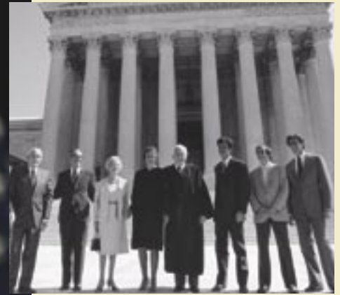
Left, Sandra Day O'Connor at Georgetown University, October 27, 2004. Above, O'Connor poses with her family and Chief Justice Warren Burger on the steps of the U.S. Supreme Court prior to her swearing in, September 1, 1981.

provided judicial guidelines on federalism — the constitutional sharing of power between the states and the federal government — and on controversial topics such as affirmative action, the death penalty, and abortion. Through it all, she remained mindful that — as the first woman in the Court — some people might focus only on her sex and not her talent while, paradoxically, her appointment represented an achievement for American women. “The power I exert on the Court depends on the power of my arguments, not on my gender,” she once said. But she also insisted that “half the population in my country are women, and it makes a difference for women to see women in positions of authority in high office.”