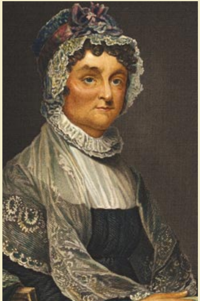
Engraved portrait of First Lady and author Abigail Adams.

Abigail Adams joined her husband in Paris and London when he served as diplomatic representative of the new nation. She dutifully acted as his hostess when he became the country’s first vice president, in 1789, and president, in 1797.