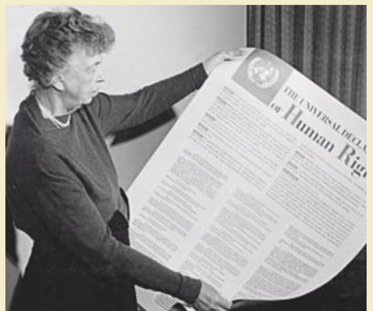
Eleanor Roosevelt regarded her work on the Universal Declaration of Human Rights as her greatest legacy.

Once Roosevelt was elected president, Eleanor toured a country devastated by the Great Depression. She reported back to him on conditions and tirelessly promoted equal rights for women and minorities, child welfare, and housing reform. She became the first president’s wife to hold regular press conferences, to write a syndicated column (“My Day”) and do radio commentary, to go on the lecture circuit, and to address a political convention. She used symbolism to great effect: In 1939, when the Daughters of the American Revolution banned African-American