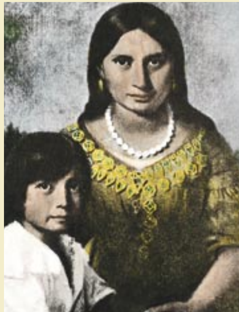
Pocahontas, after a 1616 engraving by Simon van de Passe.

The survival of the American colonies and later the newly born United States was never guaranteed — far from it. Settlers in the early 17th century — even in flourishing outposts — could count on harsh living conditions, scarcity of food, disease, and toil. The “lost colony” of Roanoke, Virginia, is ample proof of the difficulties they faced. Two centuries later, in the 1800s, Americans would trek westward across the Mississippi River from the relative comfort of established cities, seeking new territories and access to the Pacific coast. The survival of the colonies and the ability to explore western territories were critical to the establishment and growth of the United States. Two young Native-American women — Pocahontas and Sacagawea — played a vital role in these efforts.