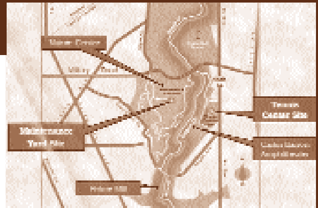
Rock Creek Park Site Location Map

Park by Bell Atlantic Mobile and other commercial carriers was not now clear. Commissioners expressed concern that all potential wireless facilities combined could have an unacceptable impact on the visual and recreational qualities of the park. They therefore disapproved the proposal until the Park Service undertakes a comprehensive study to assess the impact of all reasonably anticipated wireless communication carriers' facilities on the park. Because one of the arguments presented in support of the proposal was the increased safety that wireless communication services offer park users, the Commission also requested the Park Service to conduct a study on the need for these additional safety measures.