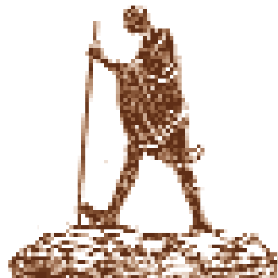
THE MAHATMA GANDHI MEMORIAL IS A GIFT FROM THE GOVERNMENT OF INDIA TO THE AMERICAN PEOPLE. Courtesy of AE Collective, P.C.

The Commission approved the site and sculptural figure for the Mahatma Gandhi Memorial, and noted its interest in receiving a complete design for the memorial. The memorial will be located on a small grassy L'Enfant Plan triangle directly across from the Indian Embassy. The National Park Service will establish design guidelines to preserve as many of the existing trees as possible. (6/3/99)