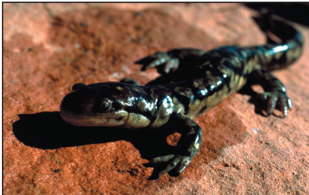
U. S. Fish and Wildlife Service

Fishless pools are ideal for amphibians because fish are efficient predators of amphibians. To benefit amphibians, minimize the chances of fish establishing themselves in a fishless pond by avoiding high-water connections with other water bodies that support fish. Ponds should have wide buffer strips to improve water quality and provide post-breeding habitat. Access by domestic livestock should be managed to reduce their impact, as intensive wading can disturb