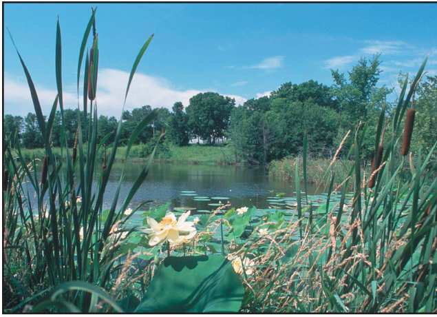
A variety of vegetation in and around ponds can improve wildlife habitat and watershed health.