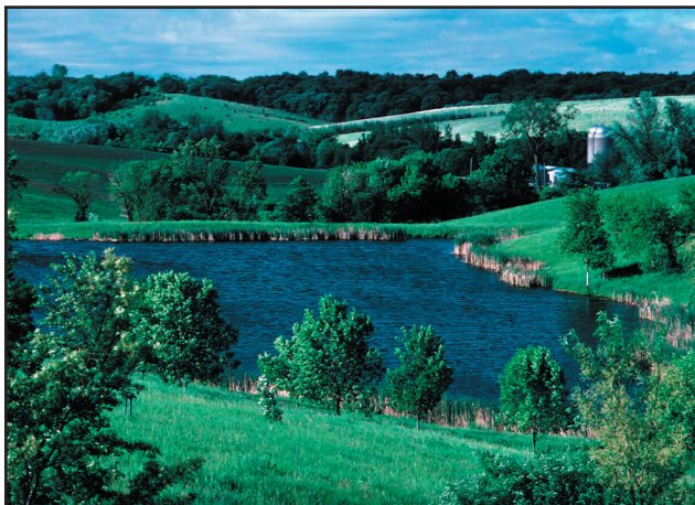
Farm pond in Jasper County, Iowa

This leaflet is designed to serve as an introduction to farm pond ecology and management. Farm pond ecology is reviewed and followed by an outline of habitat needs for various pond species. It discusses farm pond management and provides a list of landowner assistance programs. For information on pond planning, design, and construction, readers should consult the Natural Resources Conservation Service's (NRCS) Agricultural Handbook Number 590: Ponds – Planning, Design, Construction, available at ftp://ftp.wcc.nrcs.usda.gov/downloads/hydrology_hydraulics/