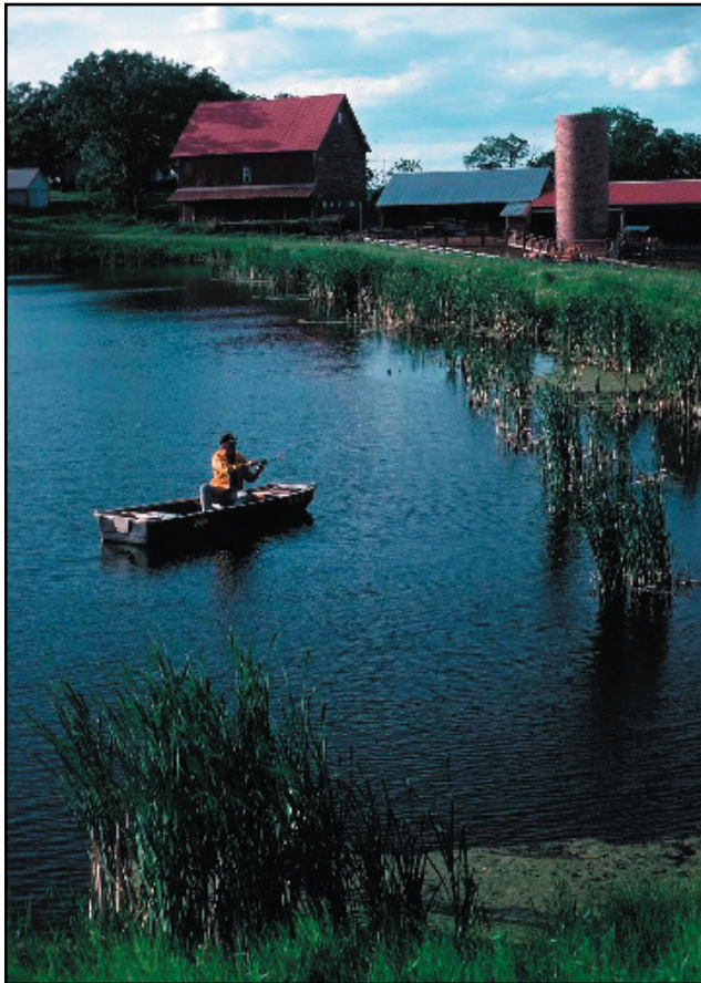
Farm ponds can provide recreational opportunities, such as fishing.

To provide maximum habitat benefits to common dabbling ducks such as mallards, blue-winged teal, and pintails, 20 percent of the wetland should be 3 to 4 feet deep, 30 percent of the wetland 1.5 to 3 feet deep, and the remaining area less than 1.5 feet deep. Creating a pond with shallow areas will also provide suitable habitat for shorebirds and wading birds that may use the farm pond. The pond shape should be irregular, with side slopes varying from a ratio of 8:1 to 16:1, to be most suitable for various types of waterfowl.