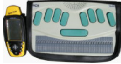
Figure 3. Graphic of the BrailleNote GPS v3.

Photographs, courtesy of Mike May, are available on the Sendero Group's Web site at http://www.gps-talk.com .