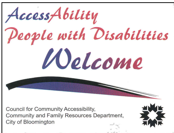
Figure 4. Sample of the AccessAbility Decal signifying that a business meets accessibility requirements of the Council for Community Accessibility (CCA) in Bloomington/Monroe County, Indiana.

For more information, see the City of Bloomington, Indiana, Web site at http://bloomington.in.gov/egov/apps/services/index.pl?path=details&id=903&action=i&fDD=1-303 .