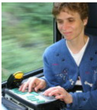
Figure 2. Woman using the BrailleNote GPS system while in transit.

Access is about infrastructure and what people can do for us, but it’s also about our own empowerment. Access to information enriches the travel experience. It’s like comparing a two-wheel drive car to a four-wheel drive car. In a two-wheel drive car you stay on the main road and don’t get into trouble. In a four-wheel drive car you get off the main road. You may get stuck, but part of the adventure is getting around on your own.