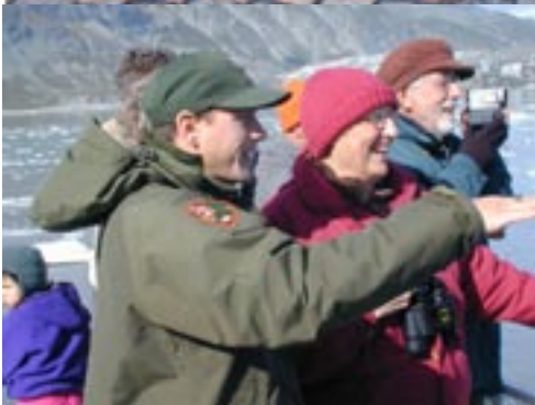
Rangers at Glacier Bay National Park & Preserve (top and bottom) and Klondike Gold Rush National Historical Park (center).