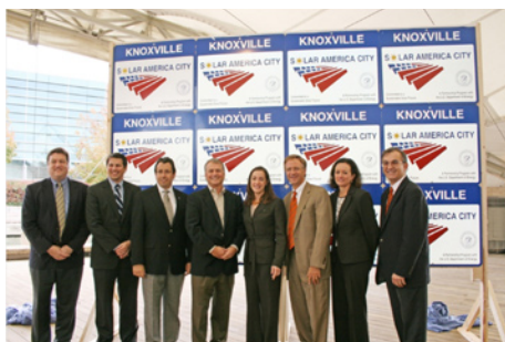
The Knoxville Solar America City team poses in front of its new road signs.