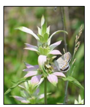
Karner blue butterfly