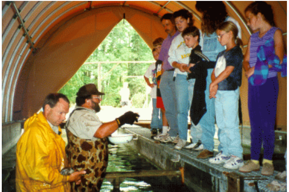
Creston National Fish Hatchery employees educating school groups on aquatic education and fish biology

Open to the public, Creston NFH welcomes visitors to the hatchery for a closeup view of the fish production process. With over 8,000 visitors annually, the dedicated staff at the hatchery will normally be available to answer your questions. Visitors are invited to walk around the raceways where most of the adult trout are held, and visit the hatchery building where eggs and small fish are reared.