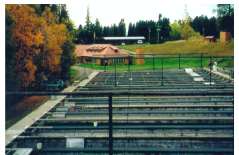
Creston National Fish Hatchery raceways

Creston NFH helps in many ways. Currently, the hatchery produces trout and trout eggs to fill Tribal, State, and research needs across Montana. These fish help to replenish and encourage sustainable trout populations and provide angling opportunities for recreational users like you.