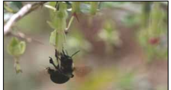
Mays Pond, Jefferson County, 2008.

U.S. Fish and Wildlife Service Southeast Region Panama City Field Office Panama City, Florida