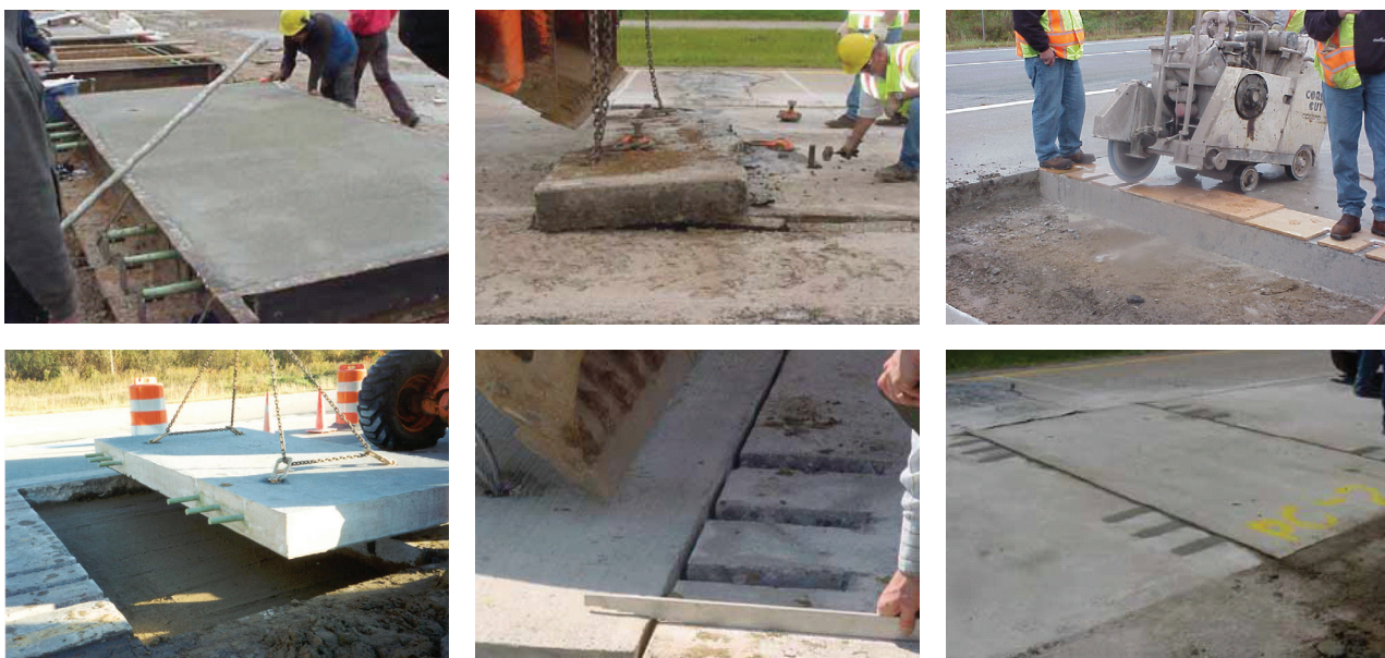
Figure 2. Precast panel fabrication and installation sequence in the Michigan field study.

Two of the installed slabs sat slightly higher than the adjacent existing concrete surface. This was due to the precast panels being slightly thicker than the actual thickness of the removed pavement. Deflec-