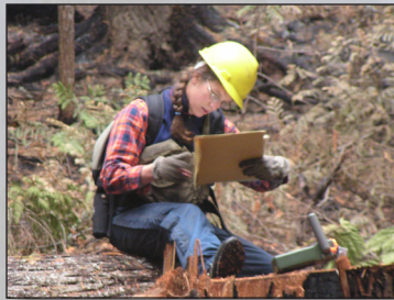
Scientists collect forest resource data throughout the Interior West.