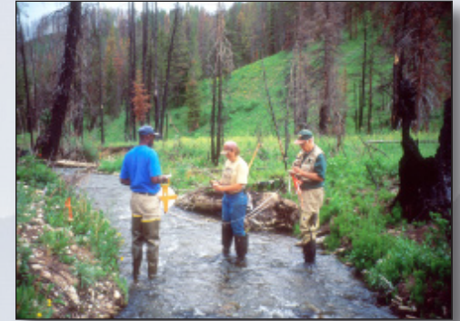
Research findings help restore stream and riparian ecosystems following disturbances such as wildfire.