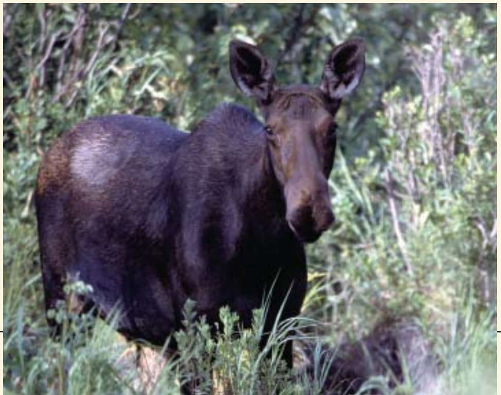
Moose at Silvio O. Conte NFWR are just one species that stands to benefit from land acquisition in New Hampshire approved by the Migratory Bird Conservation Commission.

of waterfowl habitat for Black Bayou Lake NWR; in New Hampshire, the commission approved $304,000 toward the acquisition of 516 acres of wetlands for Silvio O. Conte NFWR; and in Texas, $81,200 will go toward the acquisition of 98 acres of waterfowl habitat for Trinity River NWR. The commission approved nearly $16 million for 140,000 acres of wetlands and uplands in 11 states in the U.S. and 15 projects in Mexico.