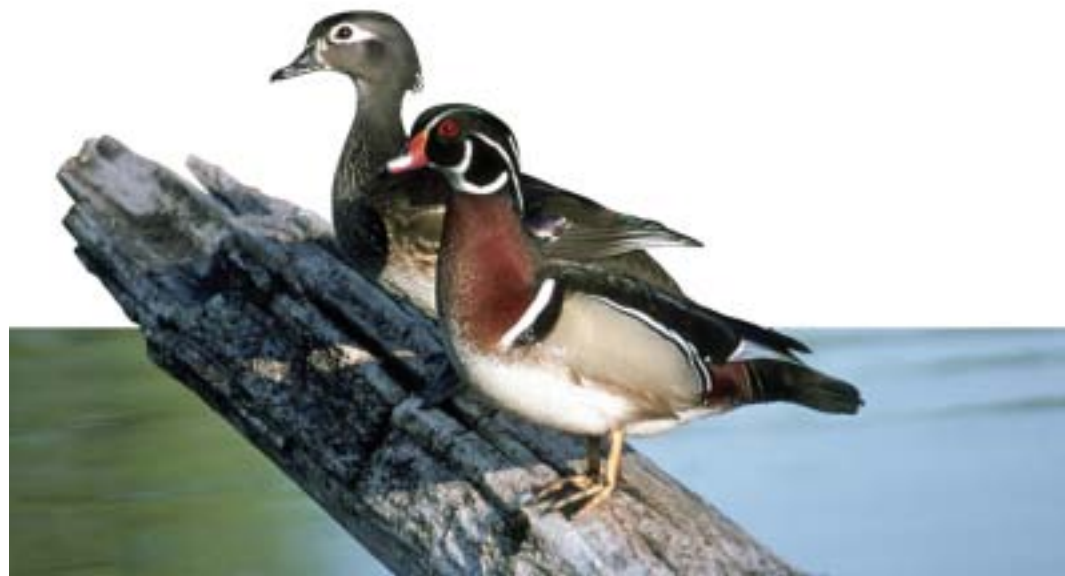
Catahoula NWR, LA, is a key stepping stone for hundreds of thousands of waterfowl and other migratory birds and a popular destination for tens of thousands of sportsmen each year.

Some of the most wildlife-rich wetlands and bottomland forests in the heart of the Mississippi Flyway will soon become a part of Catahoula NWR, LA, thanks in large part to a groundbreaking new public-private partnership called "Acres for America."