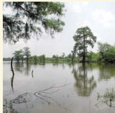
Some 6,000 new acres for Catahoula NWR contribute to an ongoing effort by public, non-profit and corporate partners to restore bottomland hardwood forests in the Mississippi River Delta.

“Acres for America” will permanently conserve about 138,000 acres, one for every acre of Wal-Mart’s current footprint, as well as the company’s future development. ♦