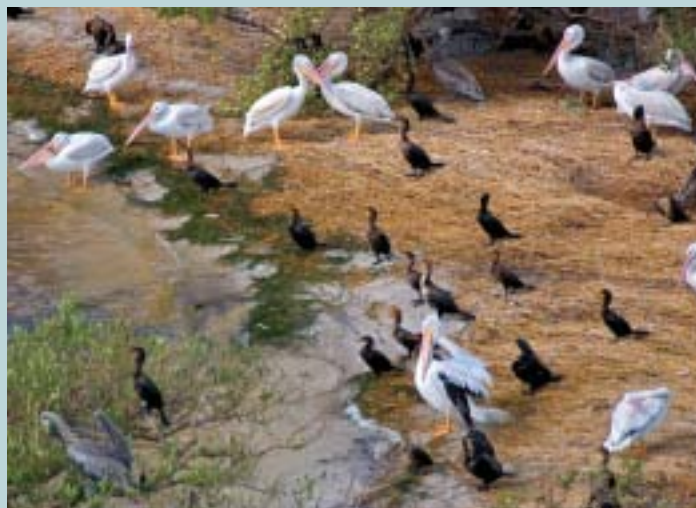
This photo, taken shortly after Hurricane Jeanne, symbolizes wildlife's resilience to the forces of Mother Nature.