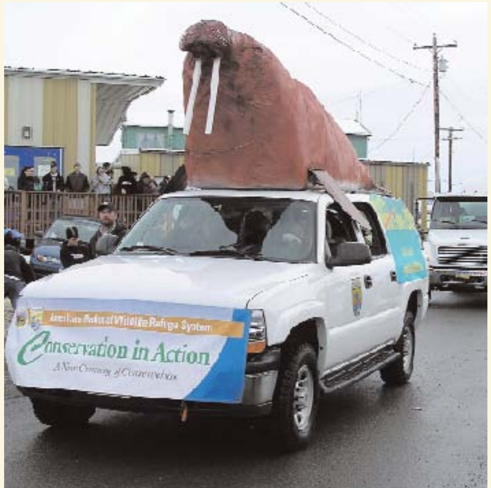
Togiak NWR, AK, won the grand prize for its walrus float in the annual Dillingham parade, sponsored by the local chamber of commerce.