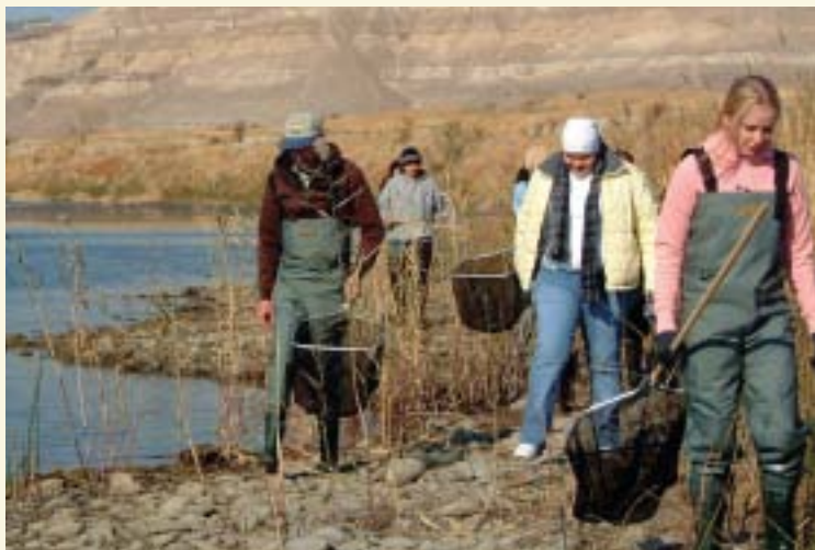
“Hands on the Land” taught practical, employable skills to high school students.