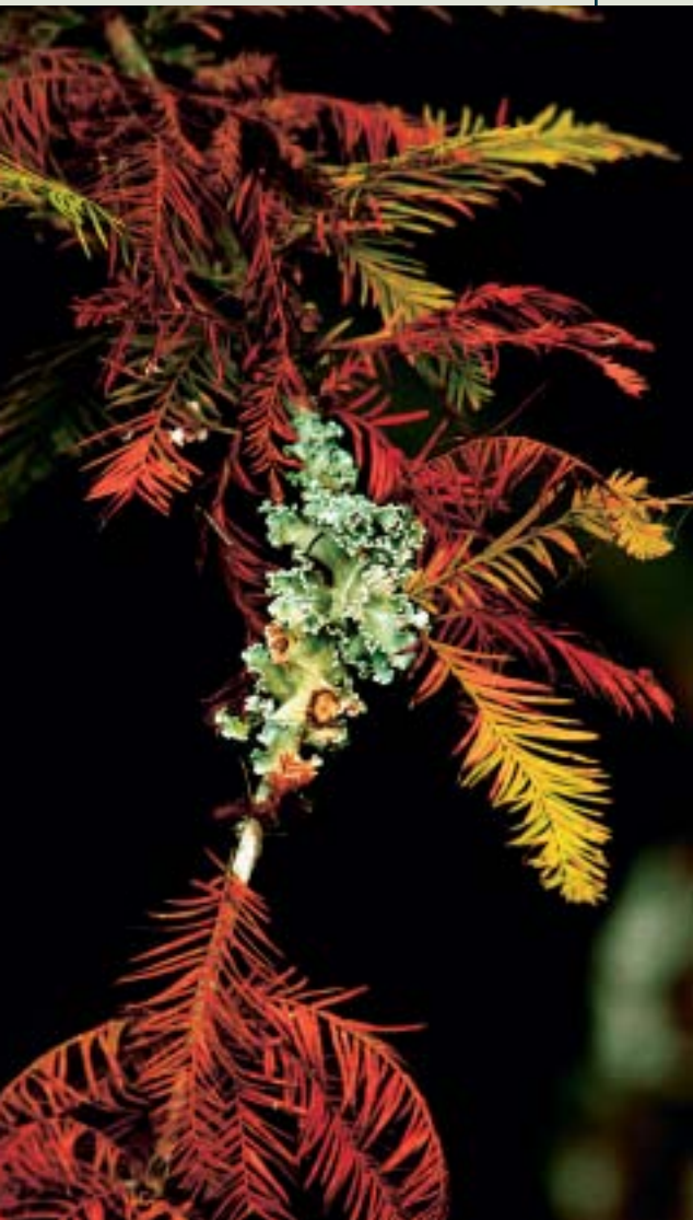
Black Bayou Lake NWR, LA, offers a beautiful lake surrounded by swamps graduating into mixed pine and hardwood uplands.