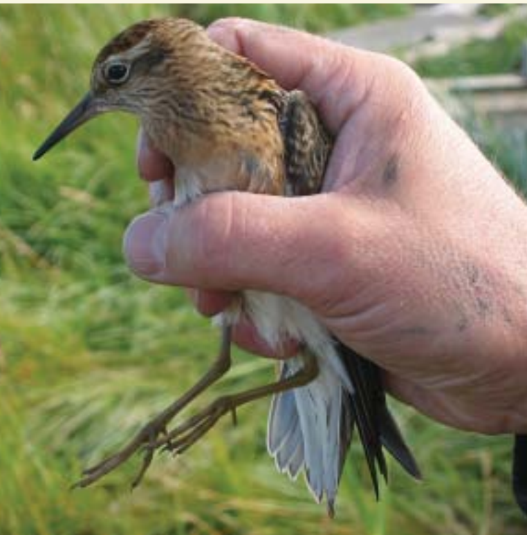
Yukon Delta Refuge hosts the majority of North America's bar-tailed godwits and sharp-tailed sandpipers (pictured). Because of its value to many different shorebirds, the refuge is part of the Western Hemisphere Shorebird Reserve Network.