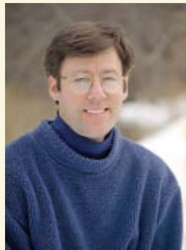
Author David Sibley

“I always knew that wherever I went, I could pick out a refuge on a map and know that I was going to have a great birding experience.”