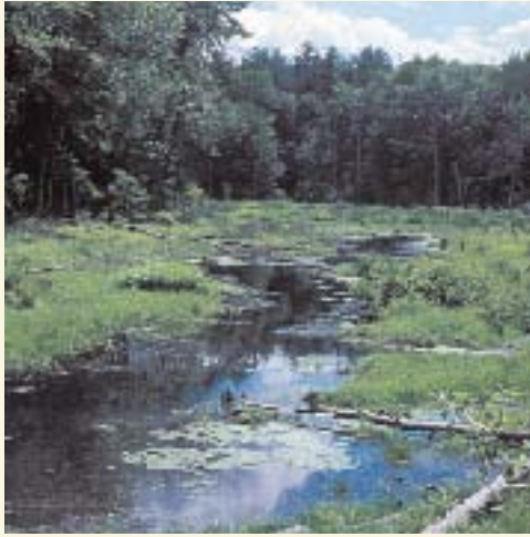
One of the Refuge System's newest sites, Assabet River NWR, MA, opened to visitors in March. The refuge joins seven others making up the Eastern Massachusetts NWRC.

🍃 Massachusetts: Friends members and refuge staff welcomed Assabet River NWR's first visitors in March, celebrating the opening of more than five miles of trails for wildlife observation and photography. Fishing and hunting opportunities will be available in the future. A full-fledged grand opening event, featuring music, tours, exhibits and guest speakers, will be held in October. Located 20 miles west of Boston, Assabet River is one of eight refuges that make up the Eastern Massachusetts NWR Complex, created in 2000 when the U.S. Army transferred 2,230 acres to the Fish and Wildlife Service. The refuge's wetlands and forests are important feeding and breeding areas for migratory birds and habitat for several species considered threatened or endangered by the State of Massachusetts.