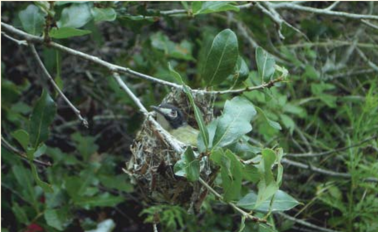
An endangered black-capped vireo nests near an observation deck at Balcones Canyonlands NWR, TX, a critical part of the bird's breeding range. (USFWS)

More recently, in April 2004, on a trip to Central Texas sponsored by The Nature Conservancy, four Central American biologists spent three days with the refuge biologist, studying the ecology of golden cheeks in their breeding range. The group exchanged extensive information about research in their countries.