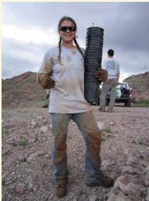
SCA interns recently spent five months at Imperial and Cibola NWRs, AZ, helping refuge staff thwart the spread of exotics.

As the nation's oldest and largest provider of conservation service opportunities for young people, SCA is a non-profit educational organization that partners with non-governmental organizations and federal agencies.