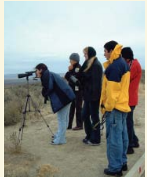
Bilingual information was also key for the “Hands on the Land” project, in which Kennewick High School Multimedia Class students created interactive Web sites for Hanford Reach National Monument at Saddle Mountain NWR, WA.

Although the Spanish pages, http://rockymountainarsenal.fws.gov/spanish/index.html , are a link from Rocky Mountain Arsenal Refuge’s English homepage, Refuge Information and