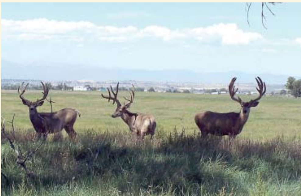
Rocky Mountain Arsenal NWR is one of the most recent national wildlife refuges to reach out to the fast-growing Hispanic population by launching a Spanish-language Web site.

“We felt it was important to make information available as quickly as possible for the large and growing Spanish-speaking community in the area,”