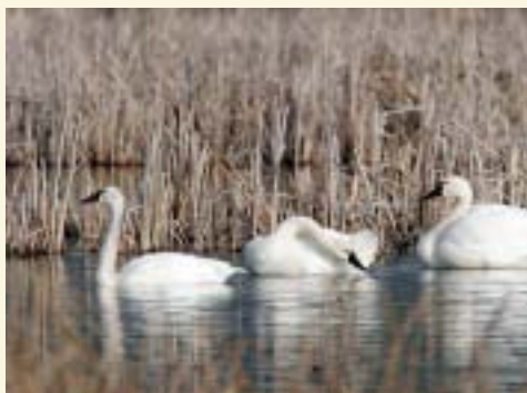
“A little gem with a lot going on,” Kootenai NWR will become the first refuge in the state to start a Friends organization.