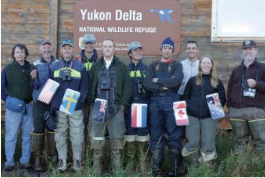
A six-nation recon team converged at Yukon Delta Refuge in 2004 to develop field protocols for more extensive shorebird research. The crew's efforts paved the way for a major international research expedition taking place in August and September 2005.

they orient to reach their distant destinations, how long their full migration takes, and where they stop along the way.