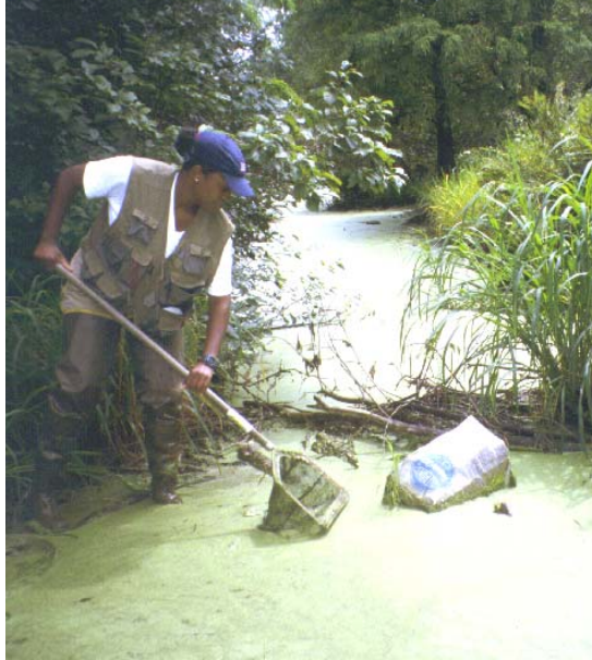
Effects of non-target mosquito spray study on the Salt Marsh, Bombay Hook National Wildlife Refuge, Smyrna, Delaware