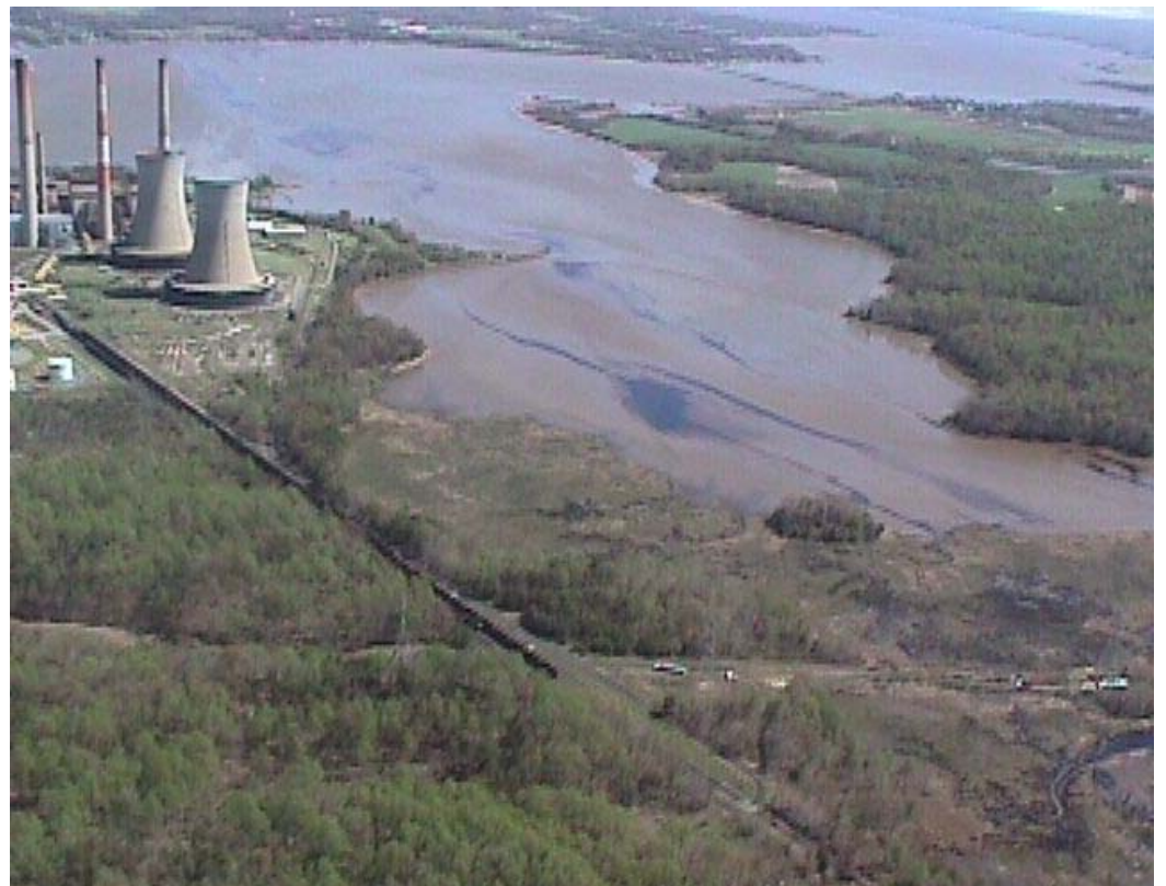
Chalk Point oil spill, Patuxent River, Maryland