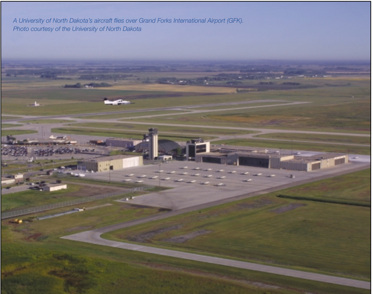
A University of North Dakota's aircraft flies over Grand Forks International Airport (GFK).

Located in Arizona, Embry Riddle's Prescott campus is one of the best options for those looking to go to school in the western United States.