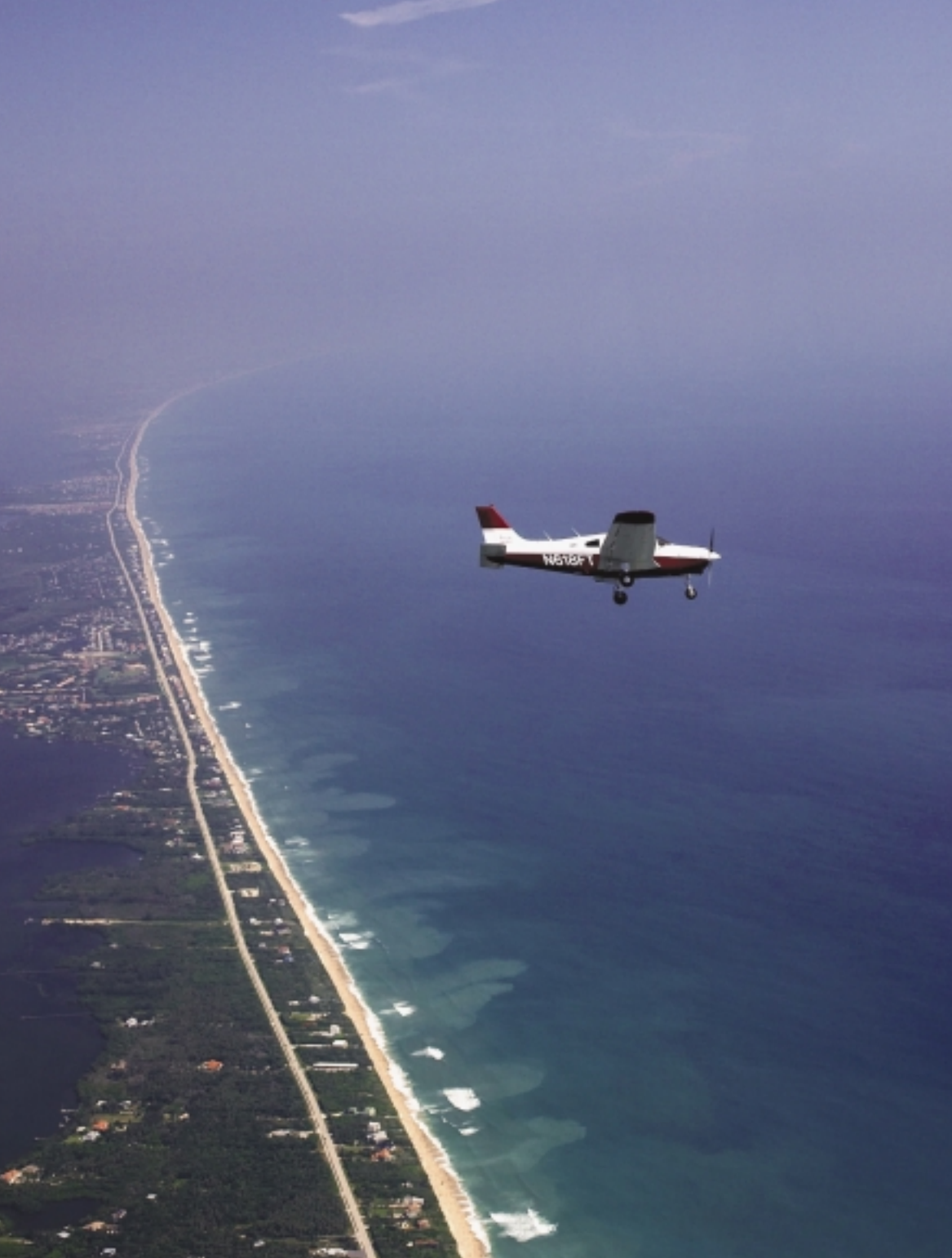
A Florida Tech Piper Warrior flies over Florida's Atlantic Coast.