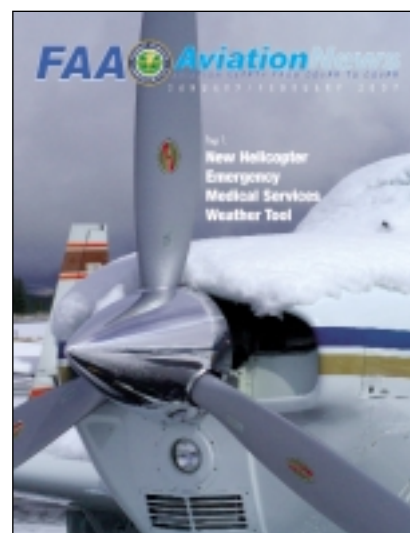
FRONT COVER: