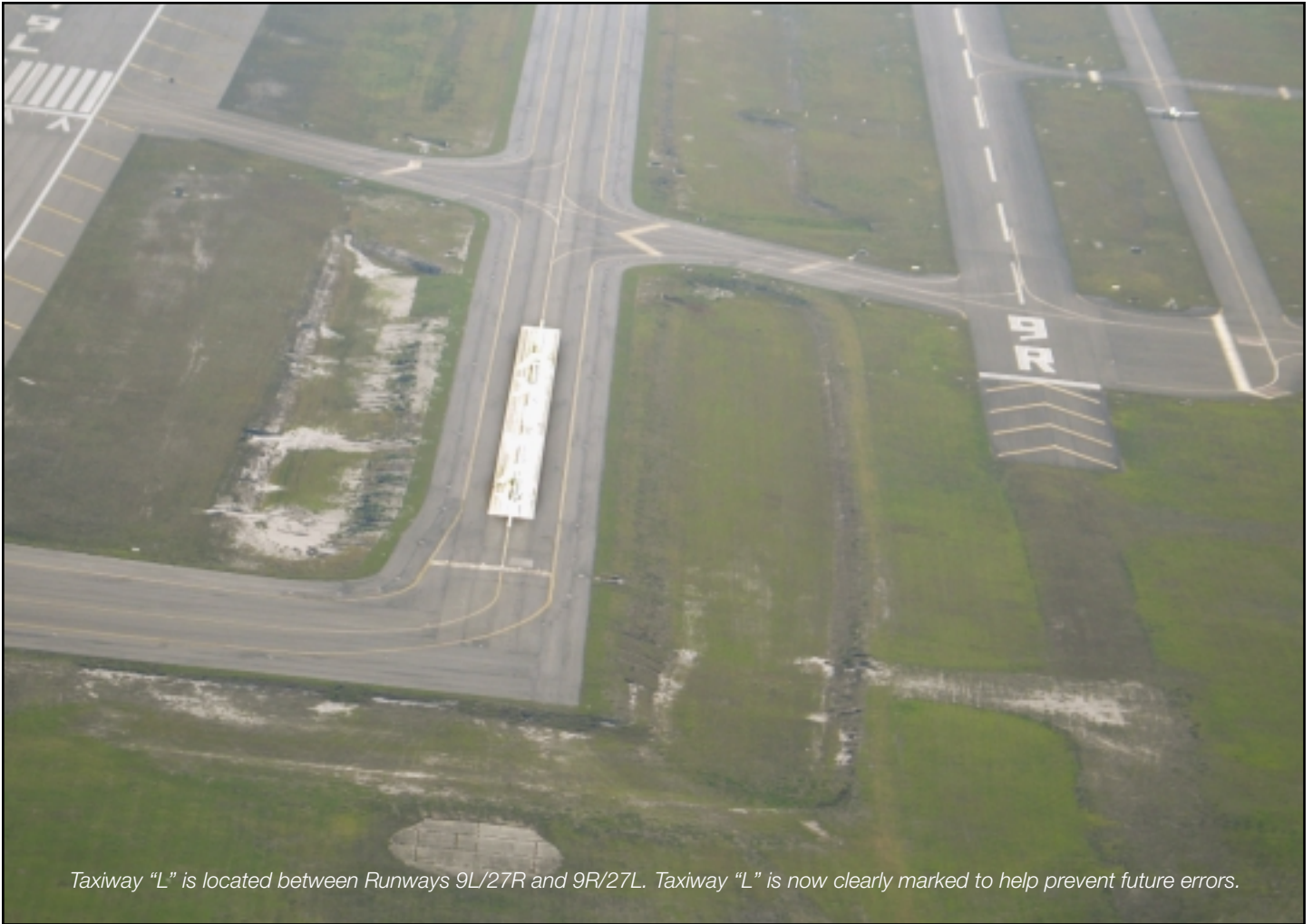
Taxiway "L" is located between Runways 9L/27R and 9R/27L. Taxiway "L" is now clearly marked to help prevent future errors.