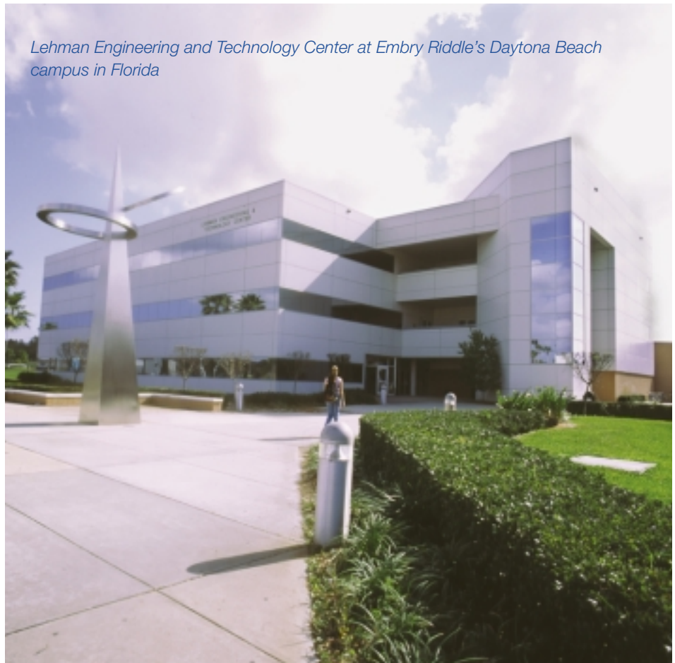
Lehman Engineering and Technology Center at Embry Riddle's Daytona Beach campus in Florida

Another thing to consider, keep an open mind. I know I had some pretty strong preconceived notions going into my selection process. After visiting my three favorite schools, my preconceived notions proved wrong and my preference order was inverted. The