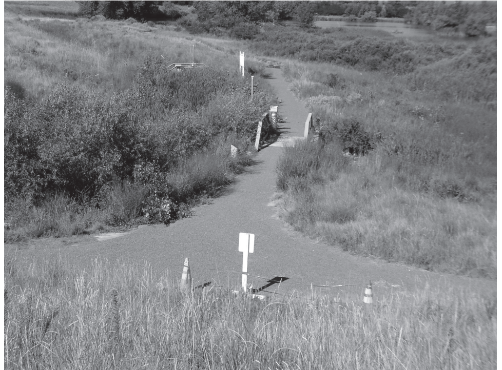
Figure 2: Site of Trail Work at Rocky Mountain Arsenal National Wildlife Refuge