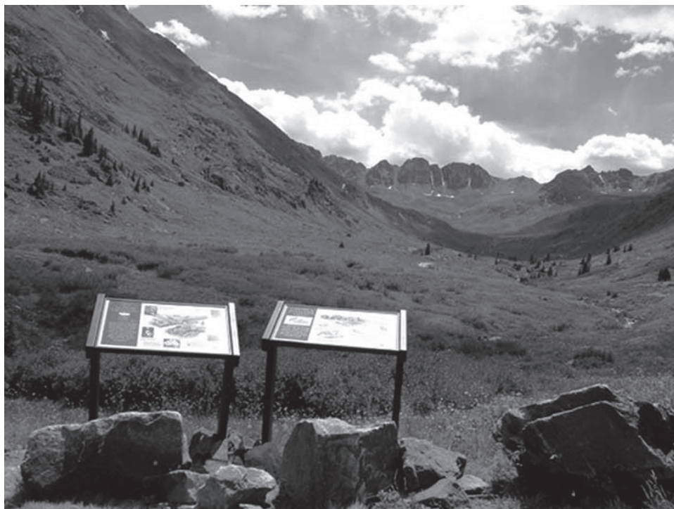
Figure 9: Interpretive Panels at American Basin