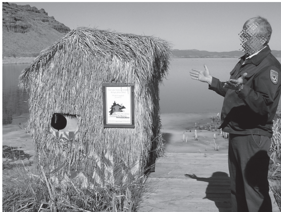
Figure 7: Photo Blind at Klamath Falls National Wildlife Refuge Complex