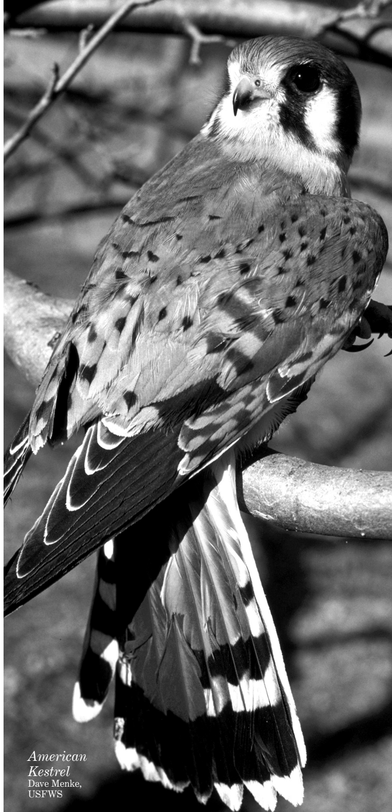
American Kestrel